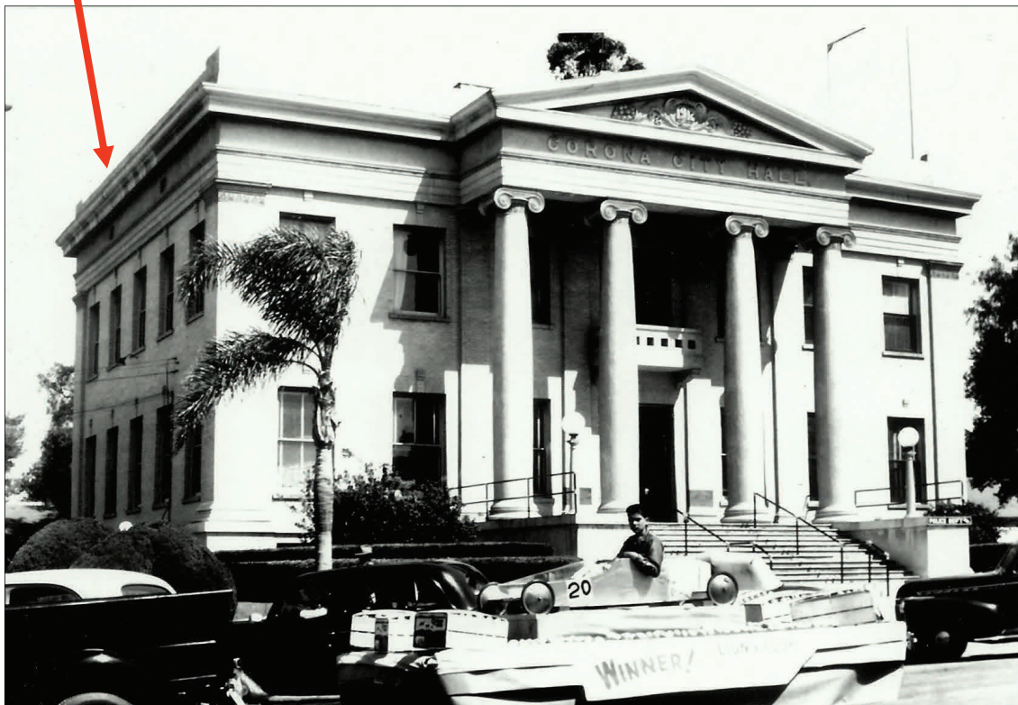
Corona's 1st City Hall was located on the northeast corner of 8th and Main.