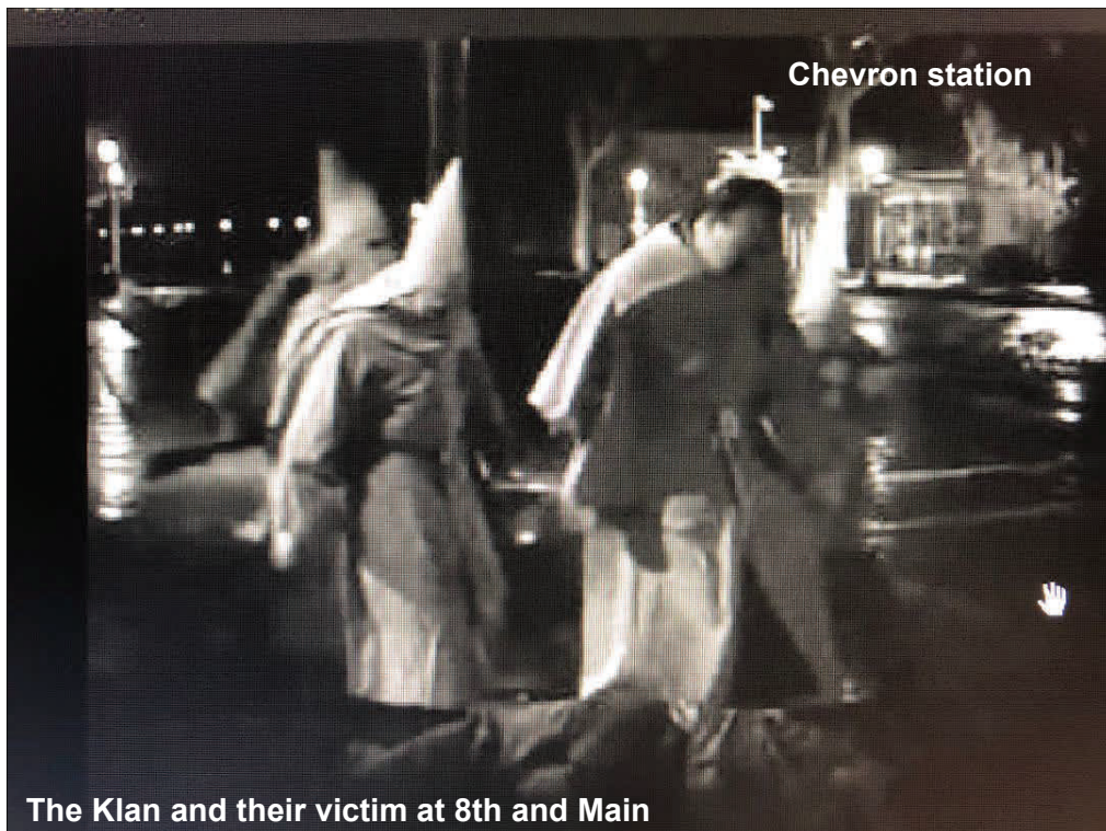
The Klan and their victim at 8th and Main