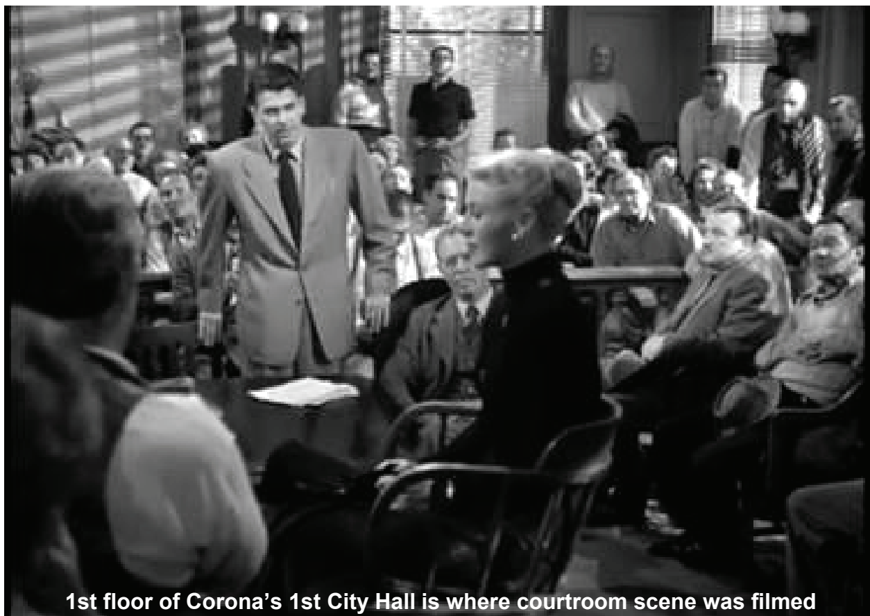
1st floor of Corona's 1st City Hall is where courtroom scene was filmed