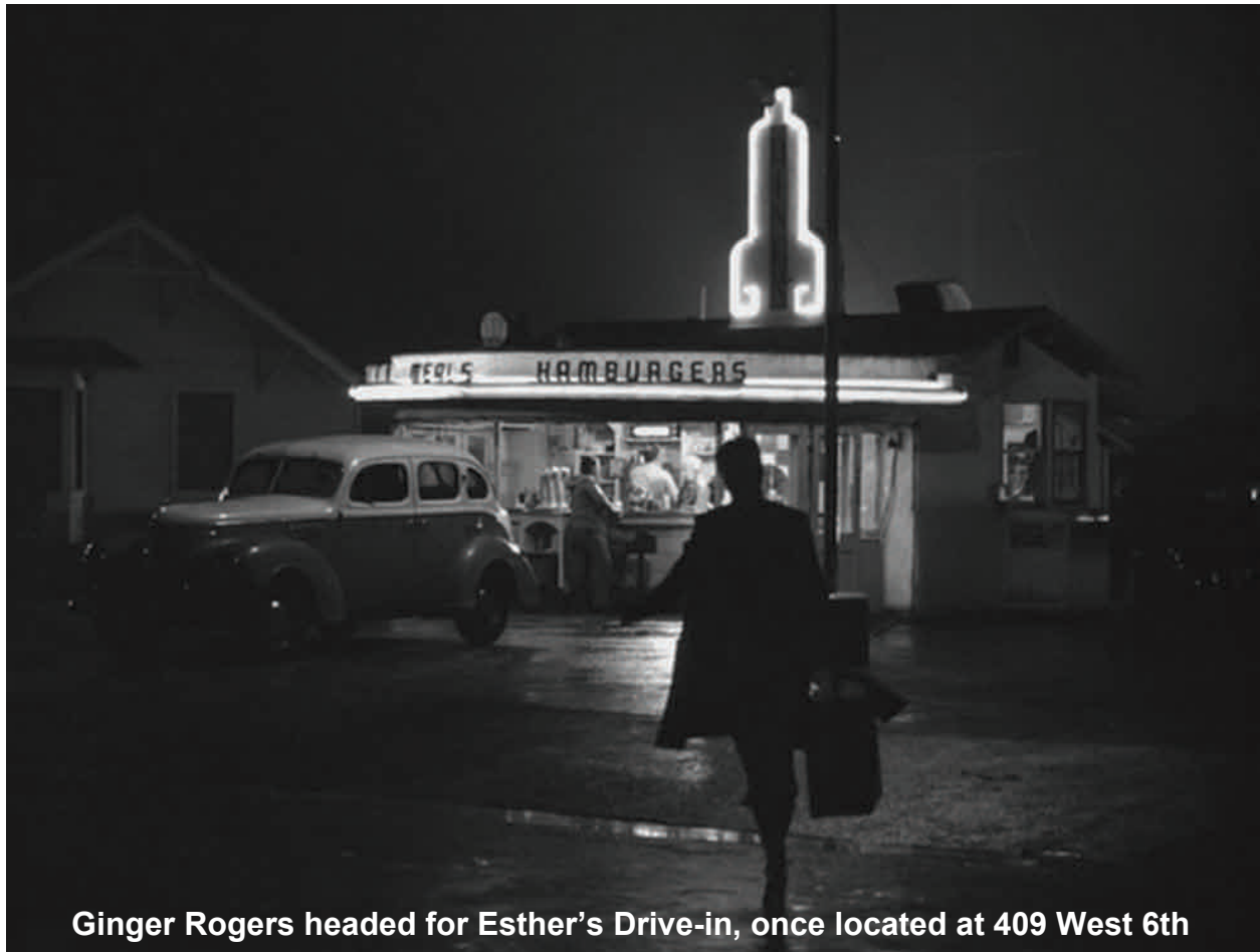
Ginger Rogers headed for Esther's Drive-in, once located at 409 West 6th