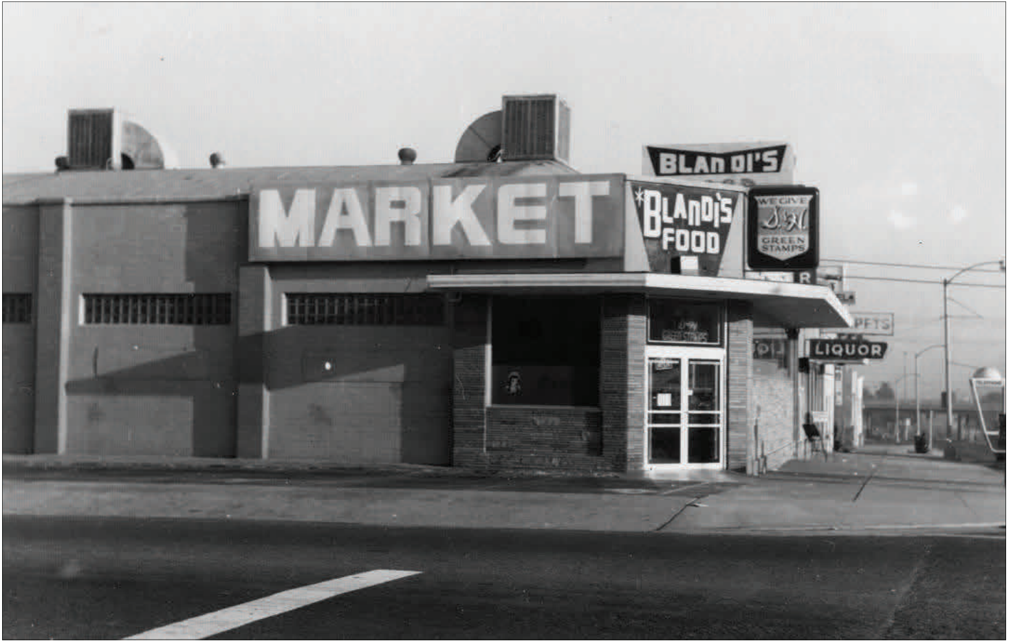
Filming for "Storm Warning" was also done at Blandi's Food Market at 316 Main Street.