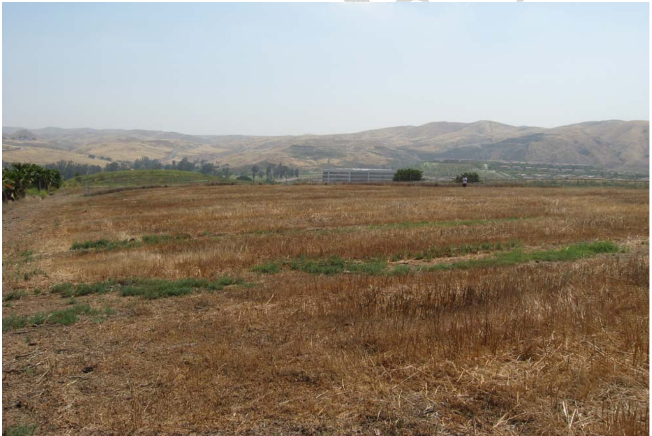
Figure 2: Photograph showing the bluff at the eastern extent of the project. View to east.

No cultural resources were identified in any of the four sample survey areas. The orchards reported by McKenna and Brunzell (2003) have been removed and are now open fields with non-native grasses. Figures 2–4 are photographs depicting project conditions.