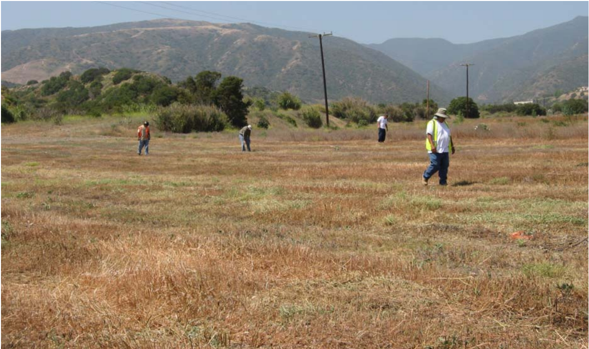
Figure 3: Photograph of the field crew in Bedford Canyon in the northern part of the project. View to southeast.