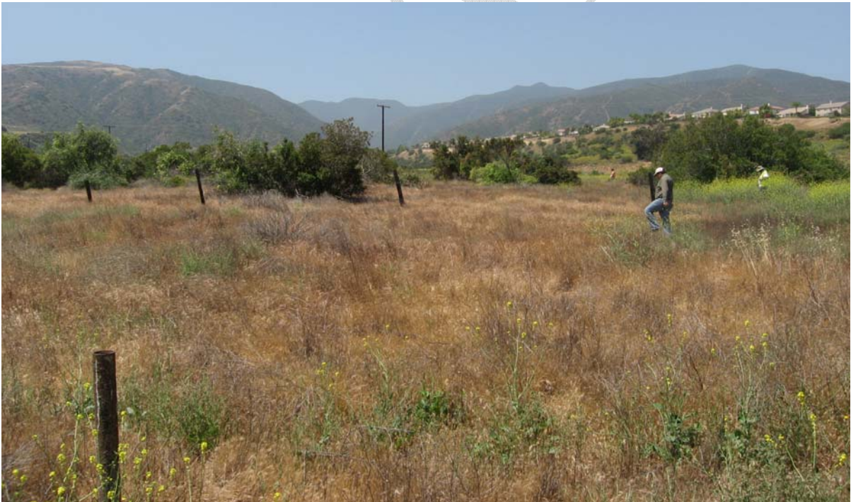
Figure 4: Photograph of the field crew in Bedford Canyon in the central part of the project. View to east