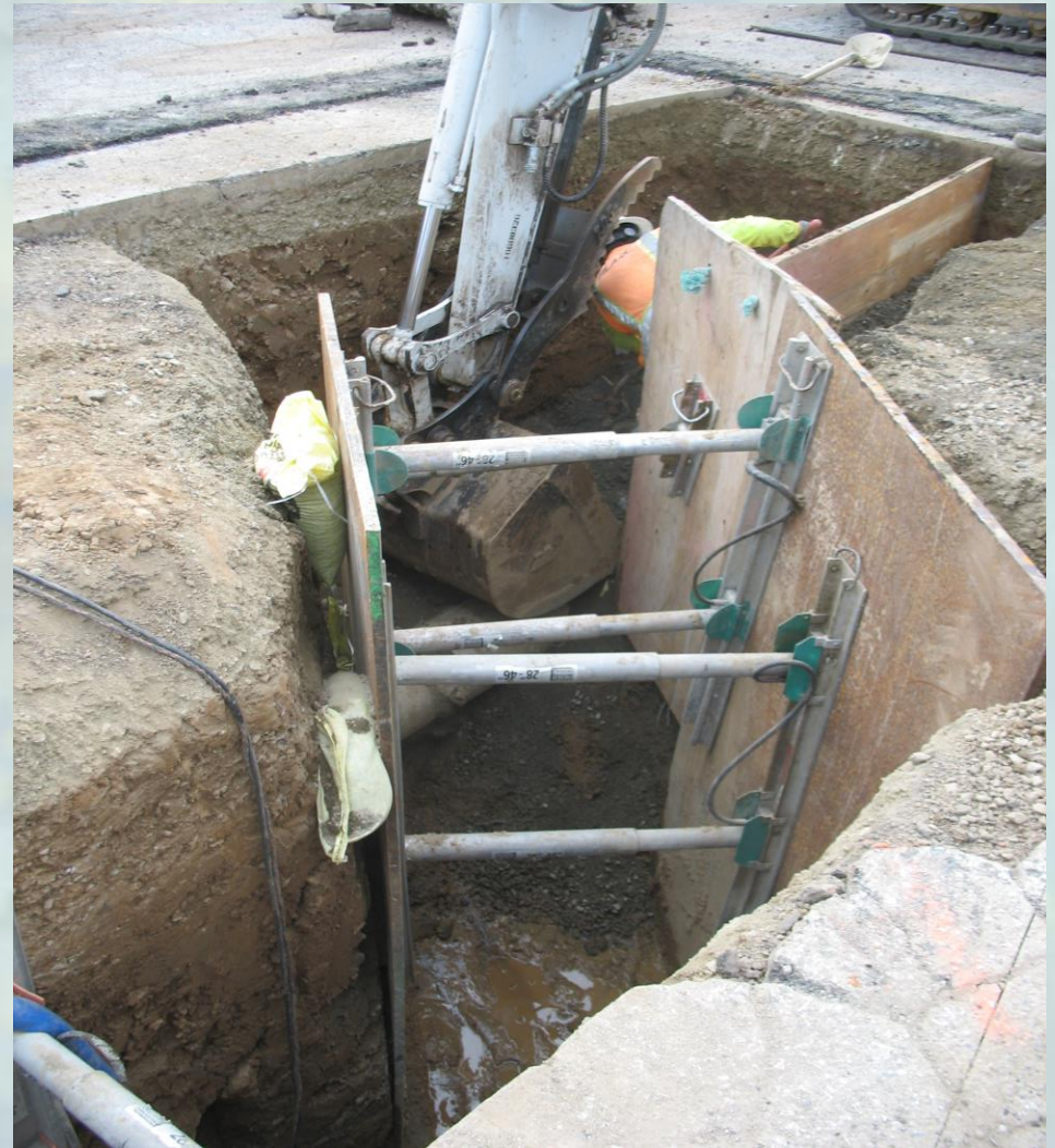
EXCAVATION FOR TIE-IN POINT (JENKS CIRCLE)