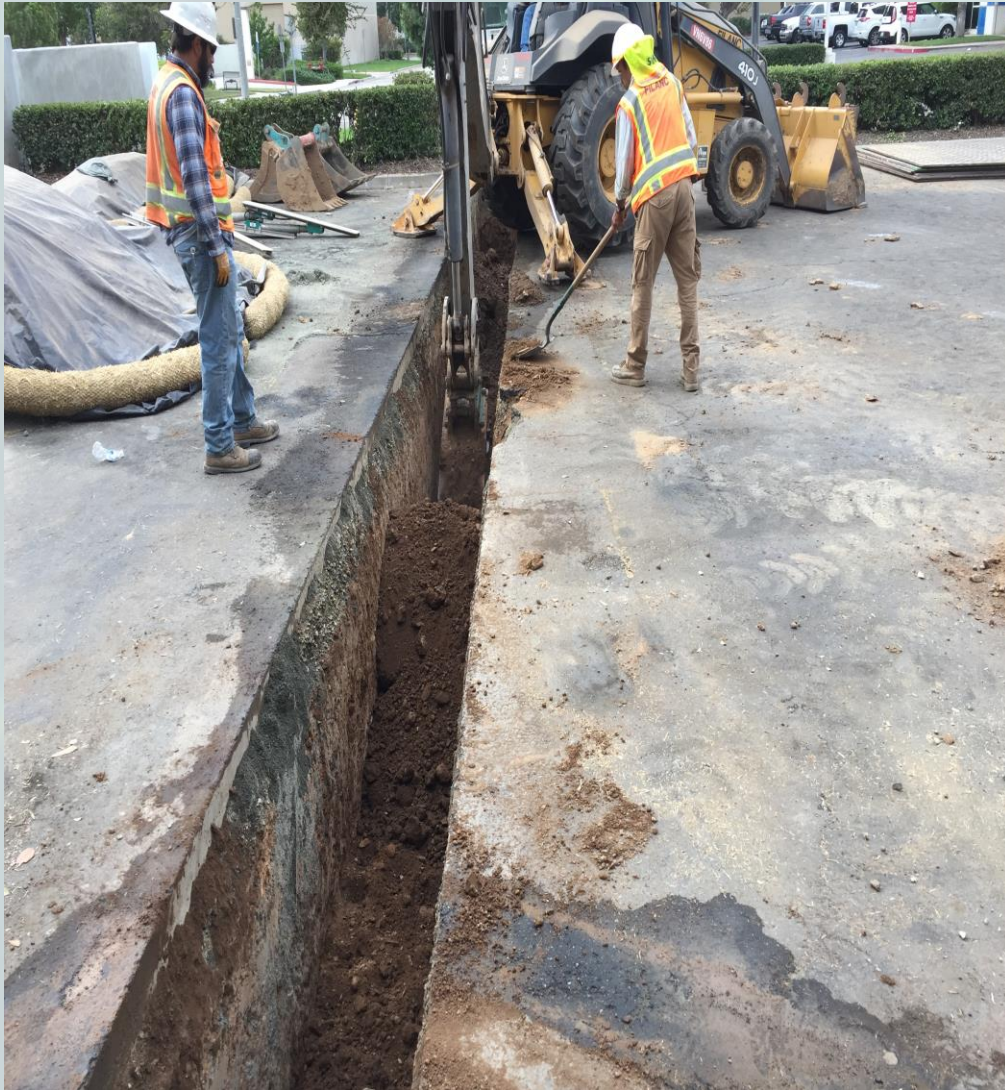
BACKFILL COMPACTION ACROSS EASEMENT – PRIVATE PARKING LOT