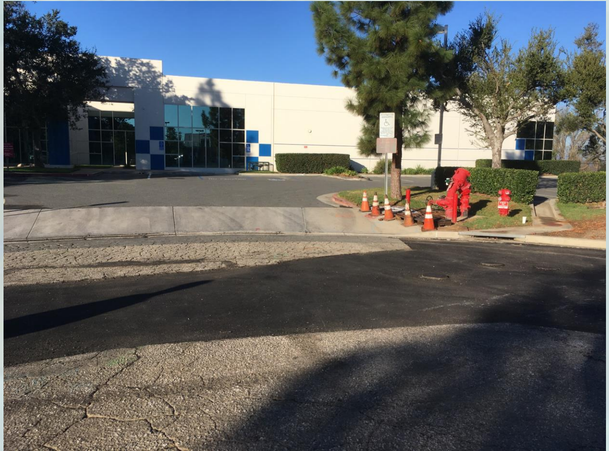
AFTER CONSTRUCTION (JENKS CIRCLE)