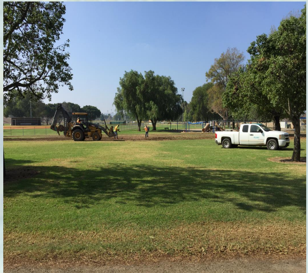
FINISH GRADING & SEEDING AFTER CONSTRUCTION