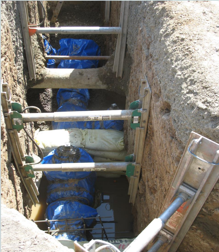
PREPARATION FOR THRUST RESTRAINTS