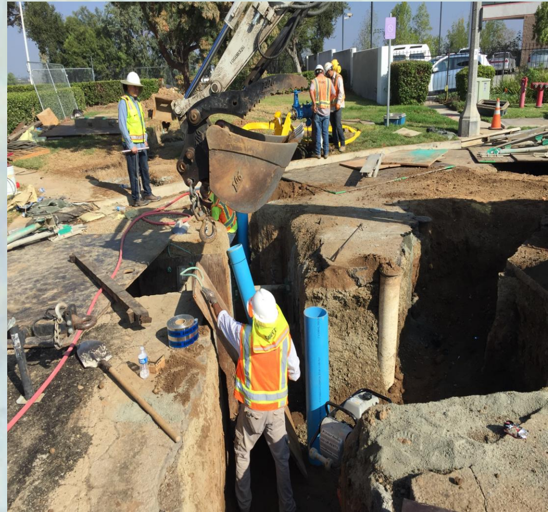
FIRE SERVICE TIE-INS - JENKS CIR.