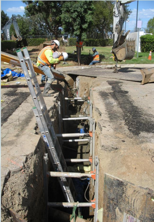
DURING CONSTRUCTION (JENKS CIRCLE)