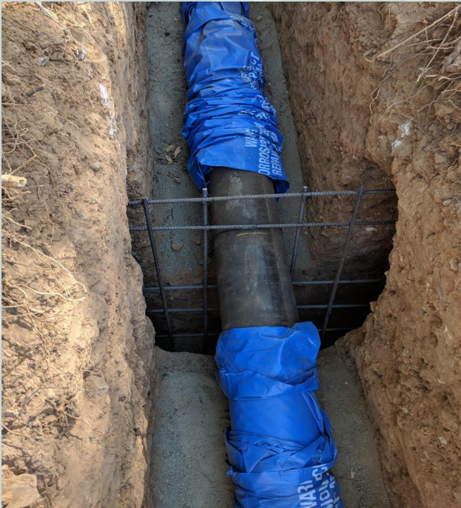
SLOPE ANCHOR REBAR