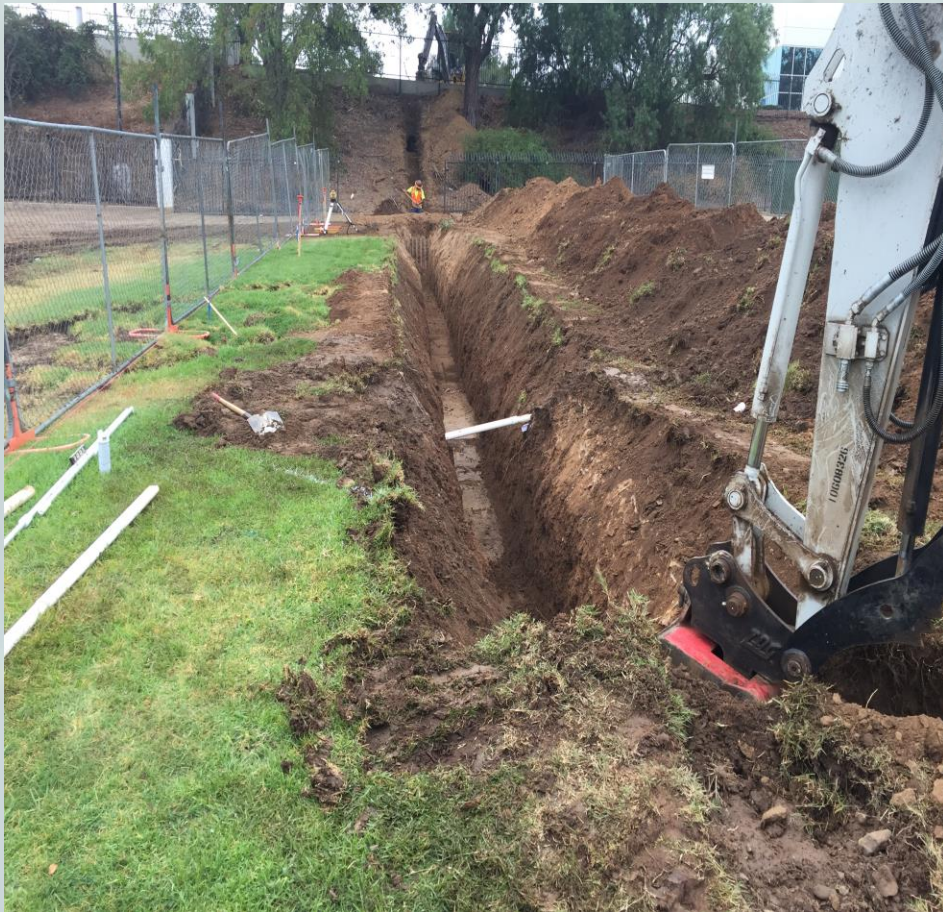
DURING CONSTRUCTION (BUTTERFIELD PARK)