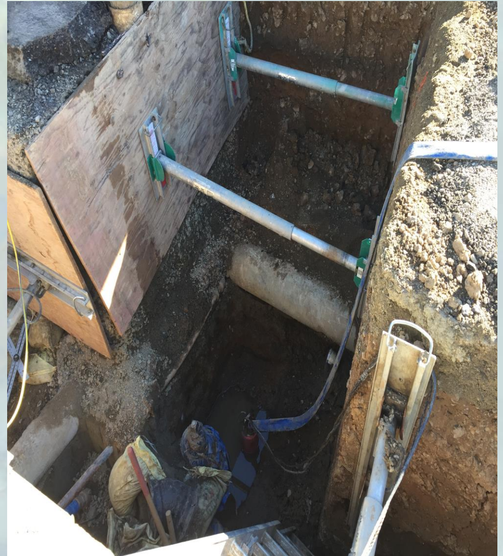
ABANDON 8-INCH WATERLINE SMITH AVENUE – BUTTERFIELD DR. 6