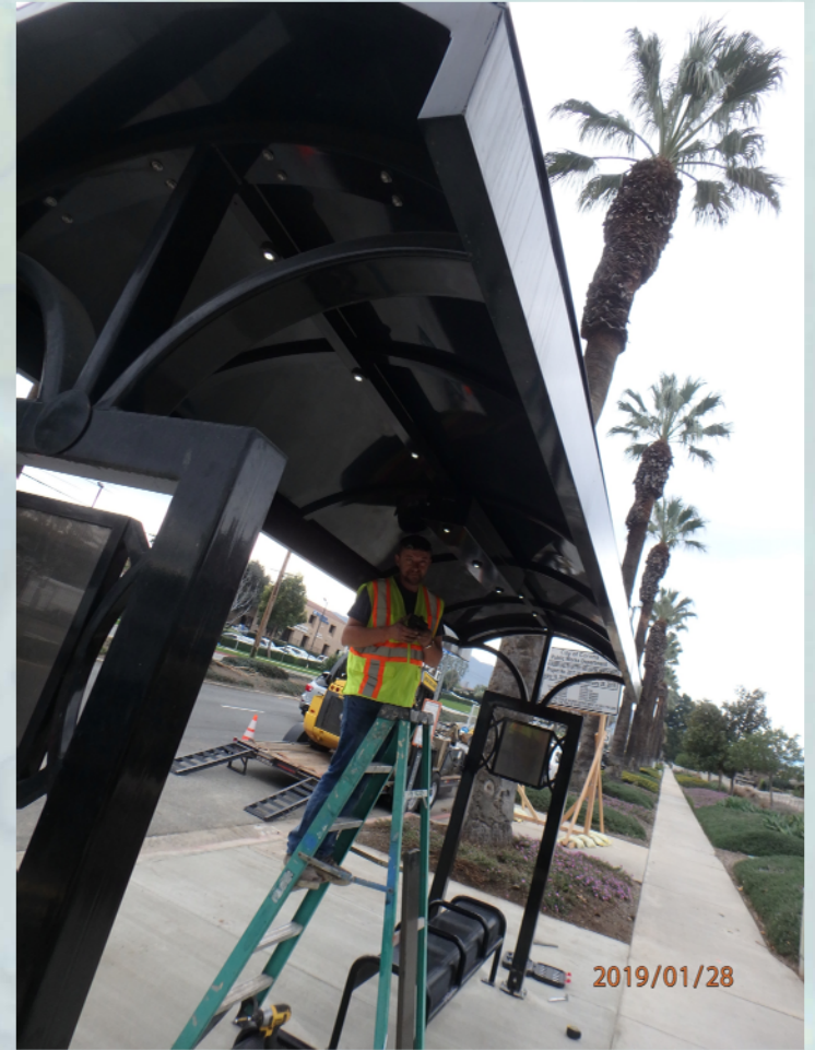
VERIFYING OPERATION OF LIGHTS