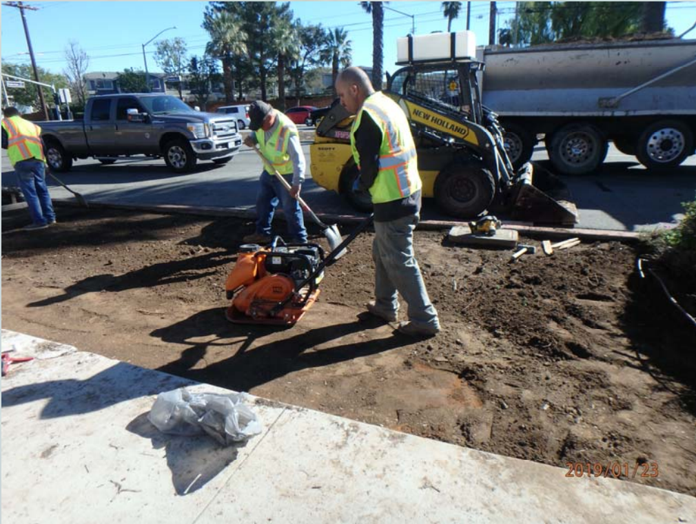
PREPARING AREA FOR CONCRETE