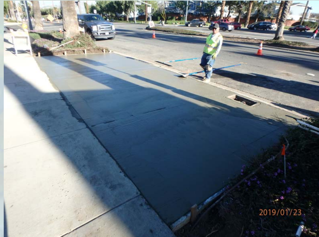
FINISHING CONCRETE BUS SHELTER PAD