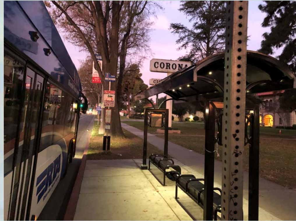
CORONA CIVIC CENTER BUS STOP ILLUMINATED AT DAWN