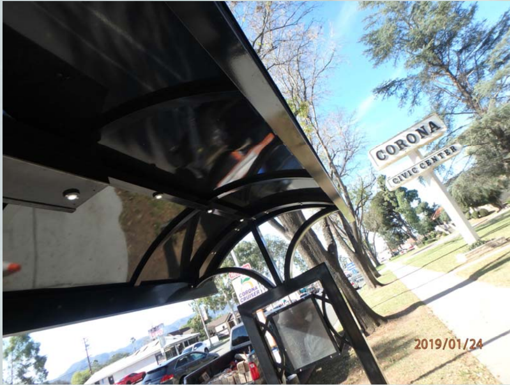
LIGHT EMITTING DIODES (LED) TESTING