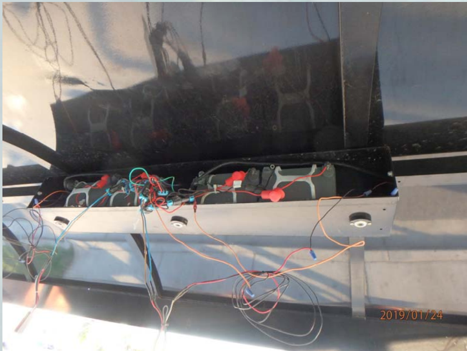
BEFORE BATTERIES REPLACED (TYPICAL)