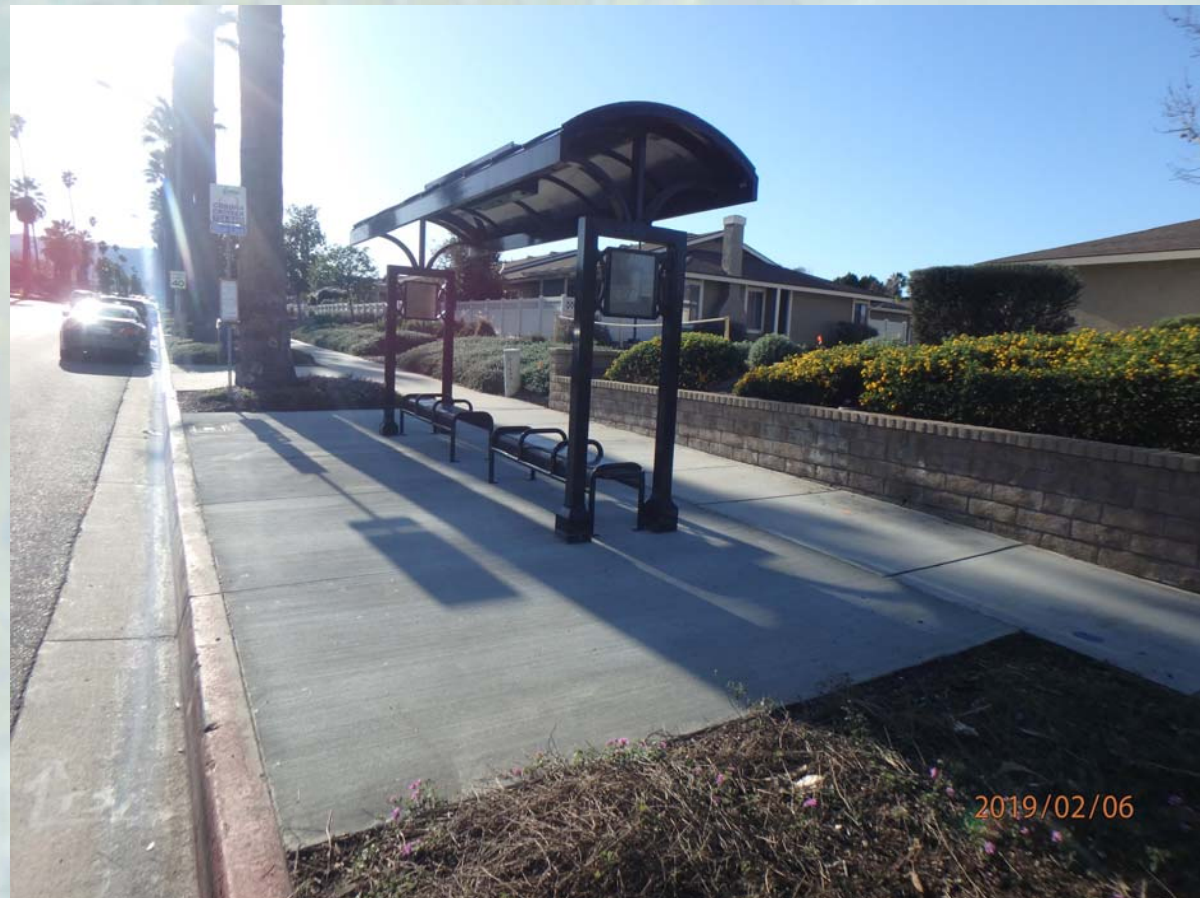
BEFORE SHELTER PLACMENT