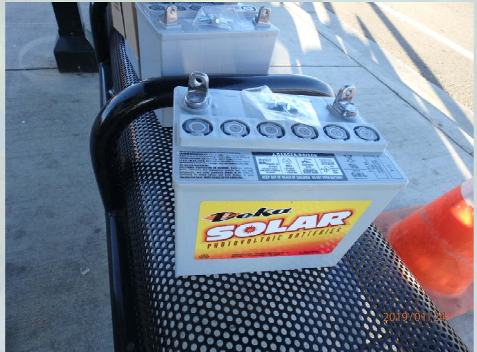
NEW BATTERIES (TYPICAL)