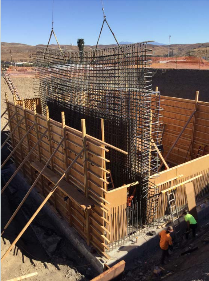
FORMING WALLS AND INSTALLING REINFORCING STEEL