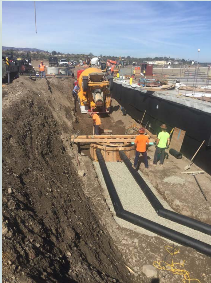
UNDERGROUND UTILITY INSTALLATION