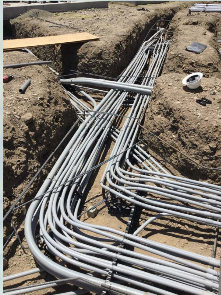
ELECTRICAL AND CONTROL CONDUIT INSTALLATION