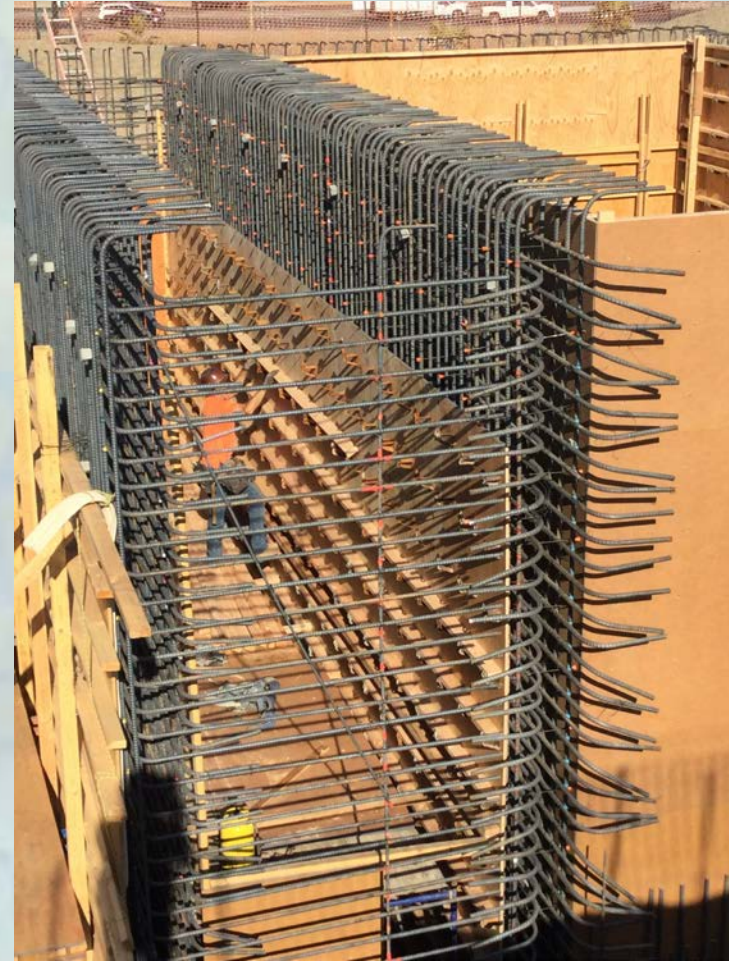
FORMING WALLS AND INSTALLING REINFORCING STEEL