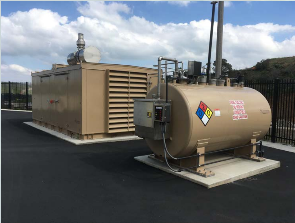
FUEL TANK AND GENERATOR