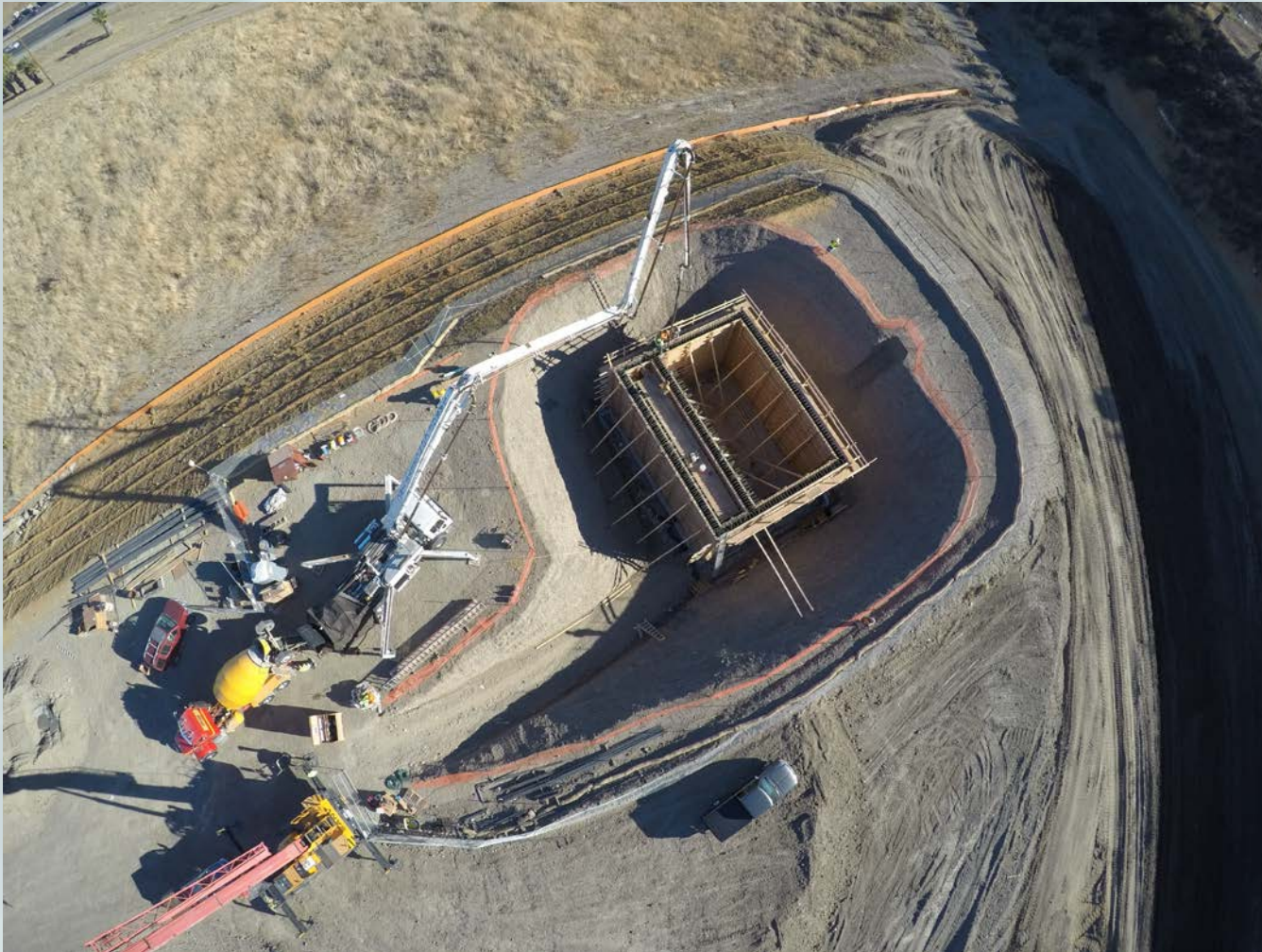
AERIAL VIEW DURING WALL CONCRETE PLACEMENT