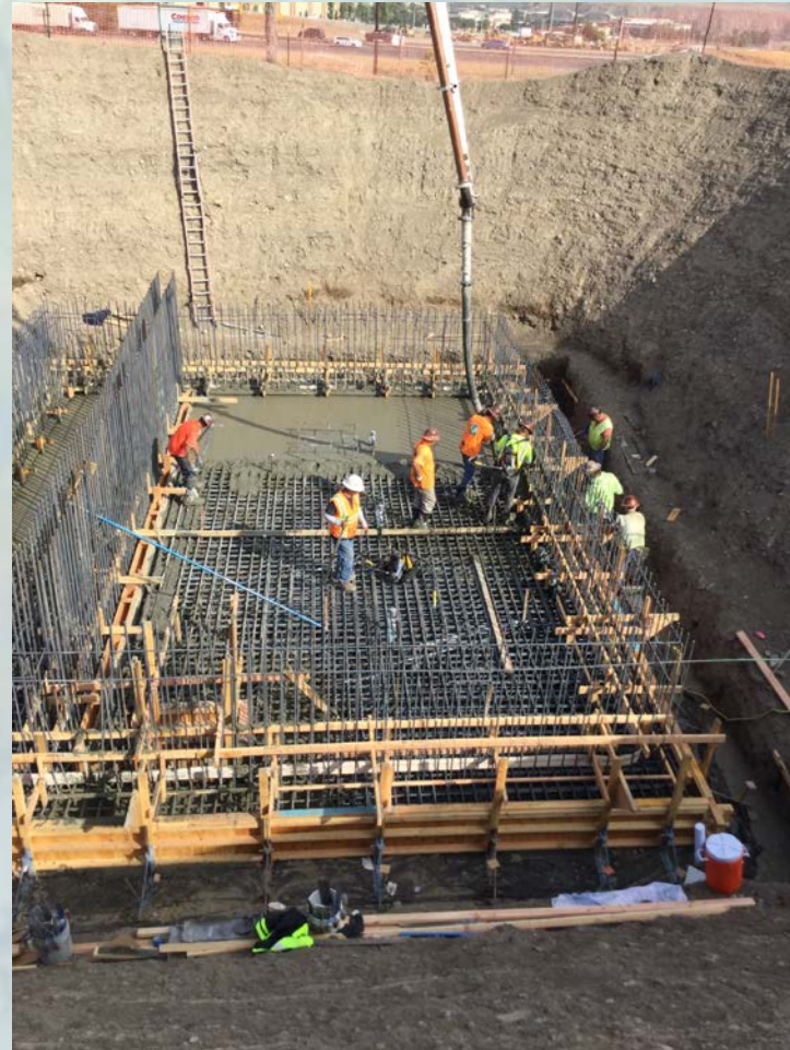
PLACING CONCRETE IN PUMP STATION FLOOR