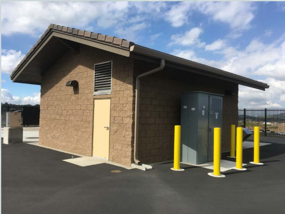
COMPLETED PUMP HOUSE