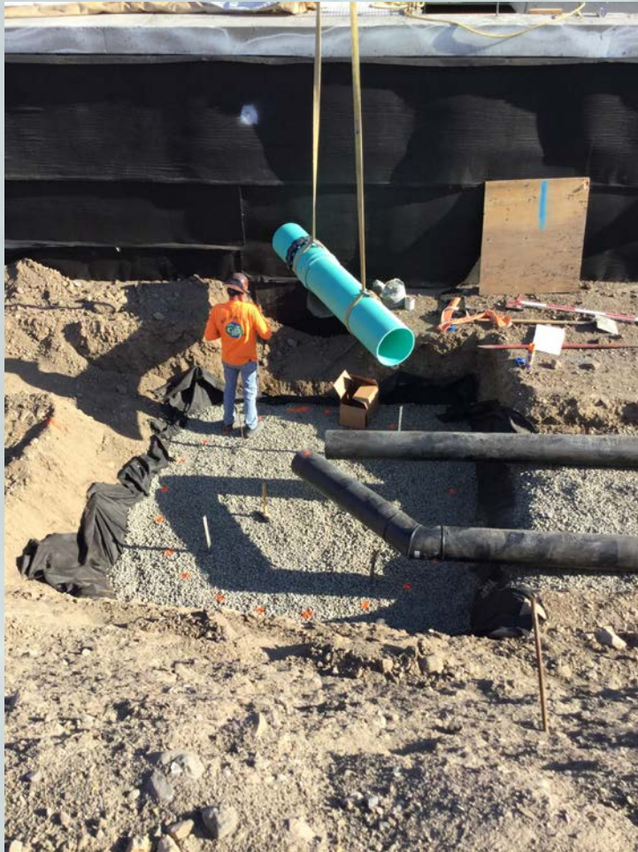
UNDERGROUND UTILITY INSTALLATION