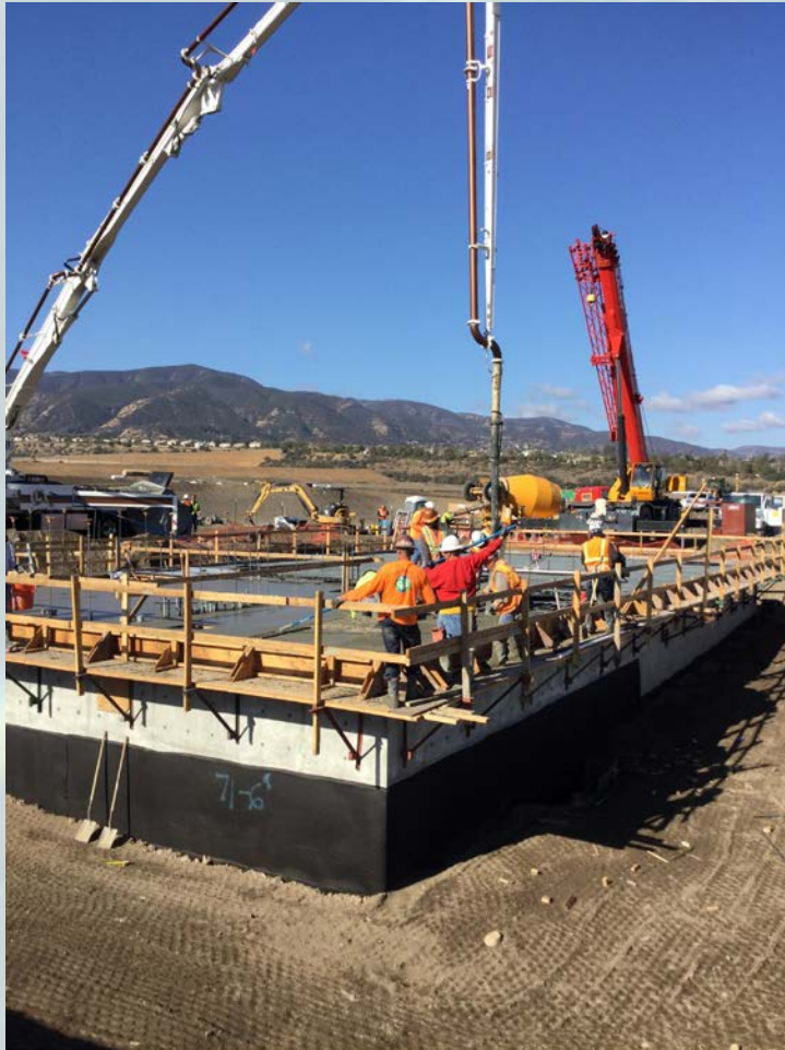
ROOF DECK CONCRETE PLACEMENT