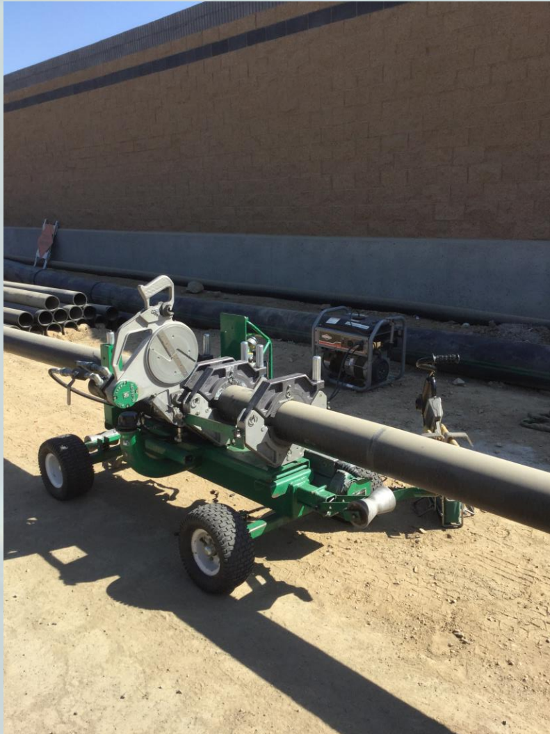
PIPE FUSING MACHINE