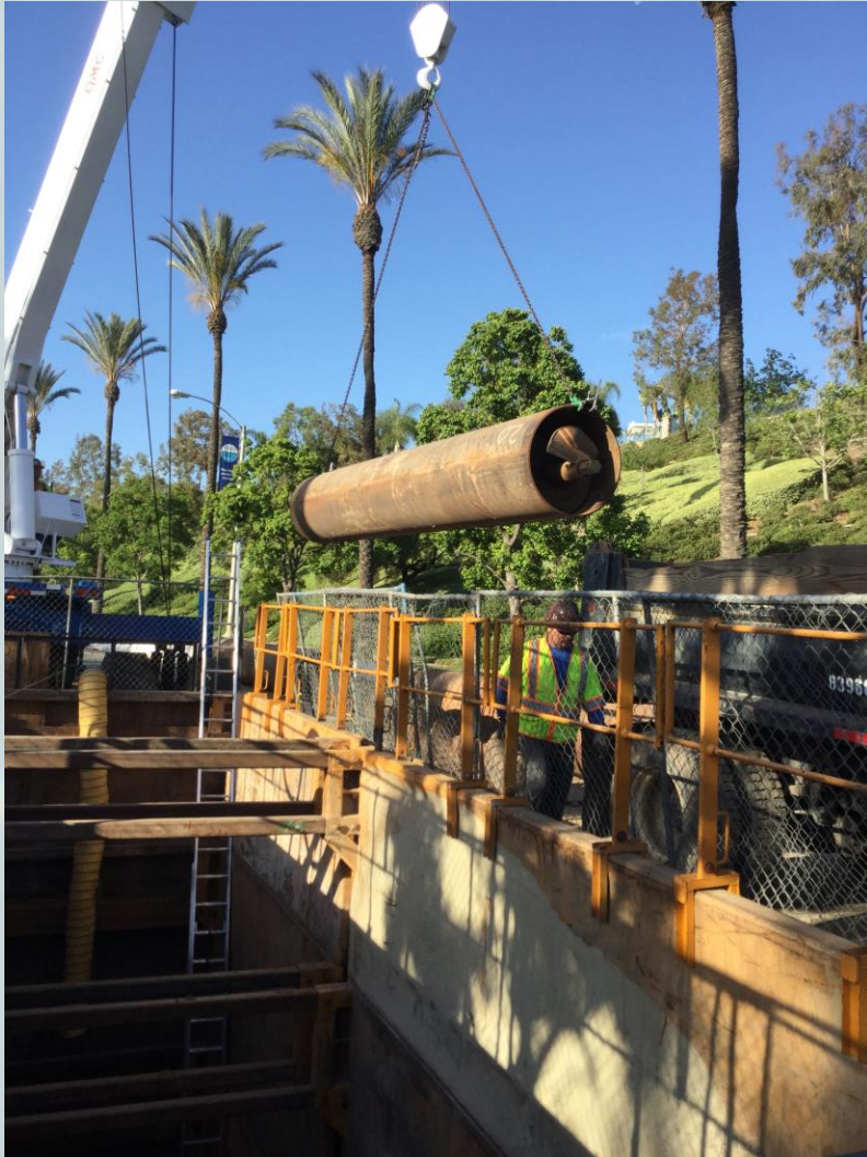
LOWERING BORING TOOL INTO PIT IN BEDFORD CANYON ROAD