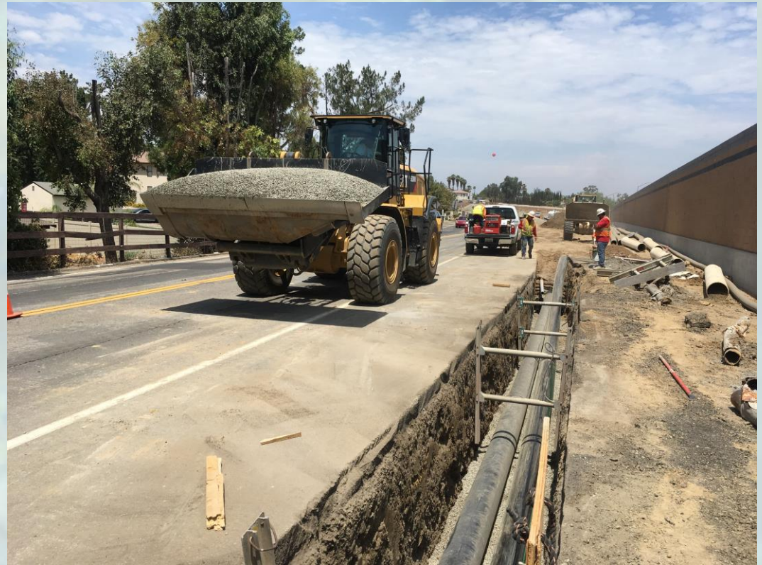
SEWER FORCE MAIN CONSTRUCTION IN BEDFORD CANYON ROAD