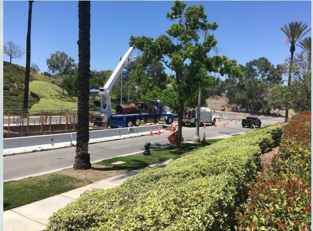
BORE AND JACK OPERATION IN BEDFORD CANYON ROAD