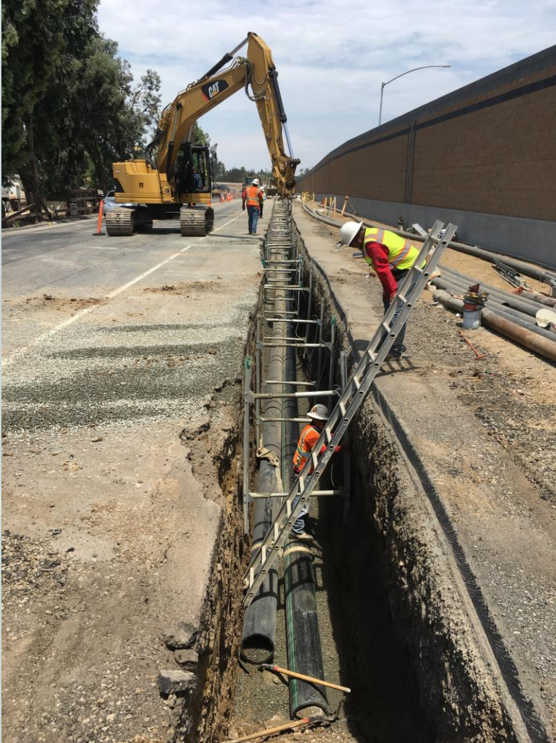
SEWER FORCE MAIN CONSTRUCTION IN BEDFORD CANYON ROAD