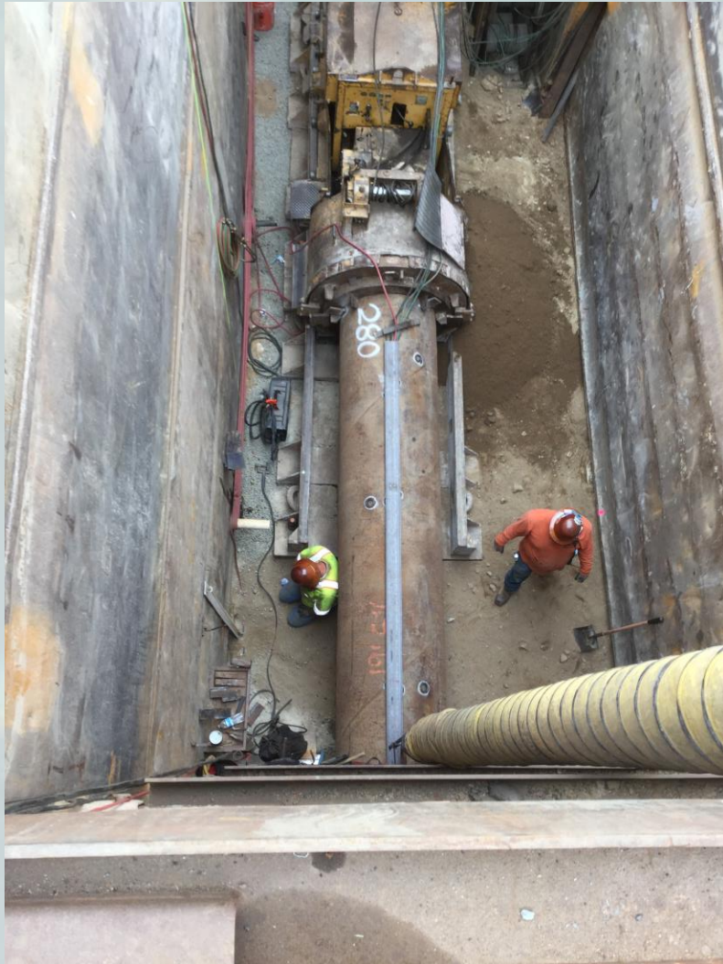
BORING MACHINE IN BEDFORD CANYON ROAD