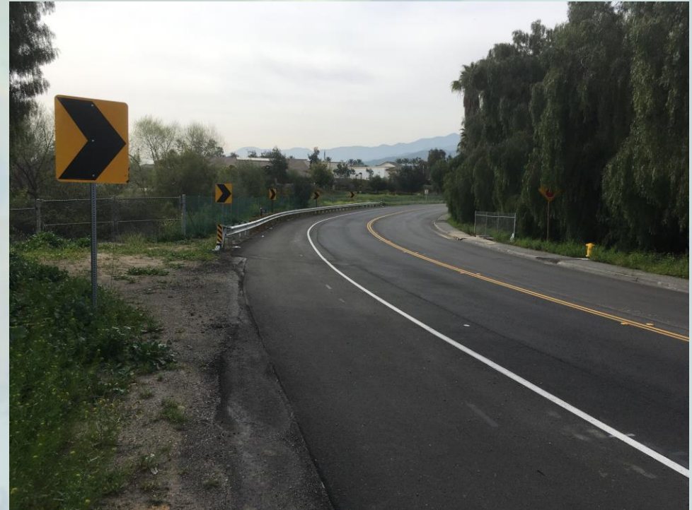
BEDFORD CANYON ROAD FINISH PAVEMENT PCI = 100