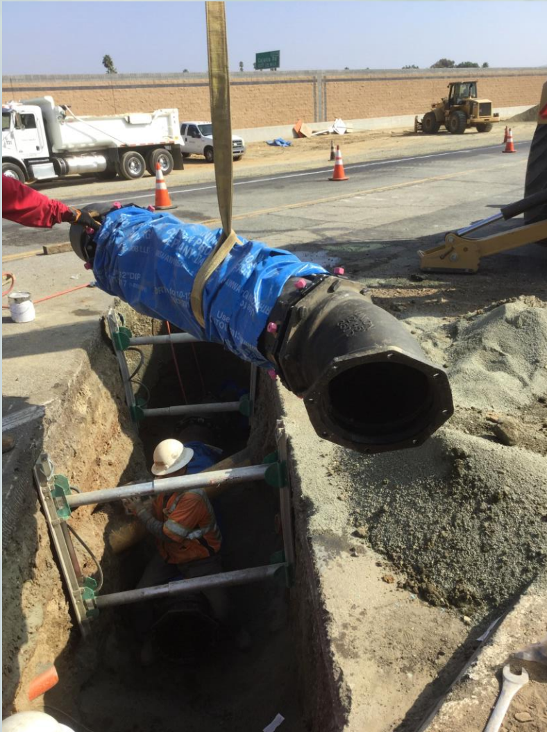
WATERLINE CONSTRUCTION IN BEDFORD CANYON ROAD