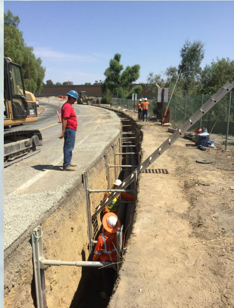
SEWER FORCE MAIN CONSTRUCTION IN BEDFORD CANYON ROAD