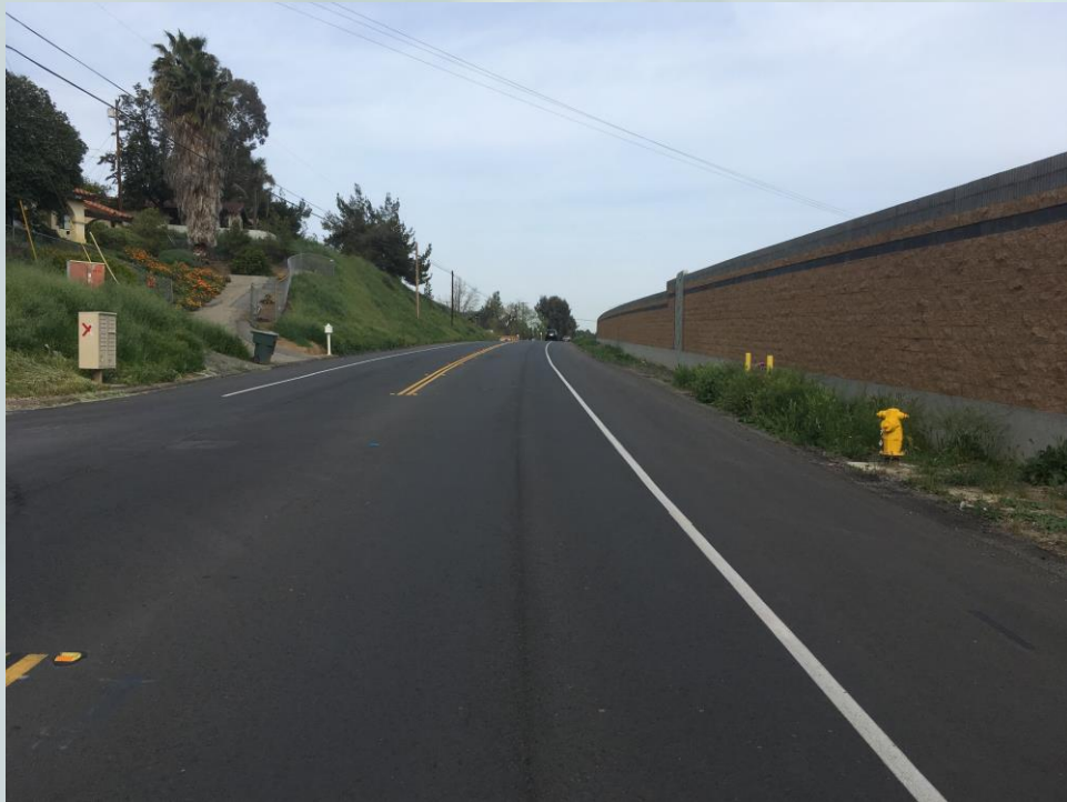
BEDFORD CANYON ROAD FINISH PAVEMENT PCI = 100