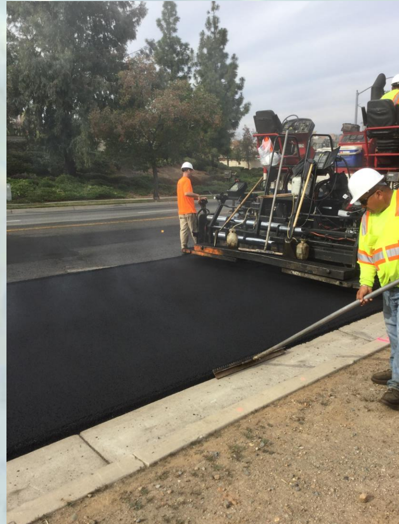
PAVING BEDFORD CANYON ROAD