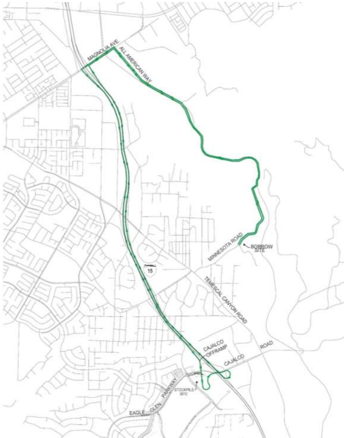
EXHIBIT C: SOIL IMPORT/EXPORT HAUL TRUCK ROUTE