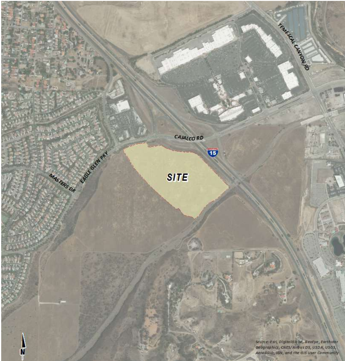
EXHIBIT A: LOCATION MAP