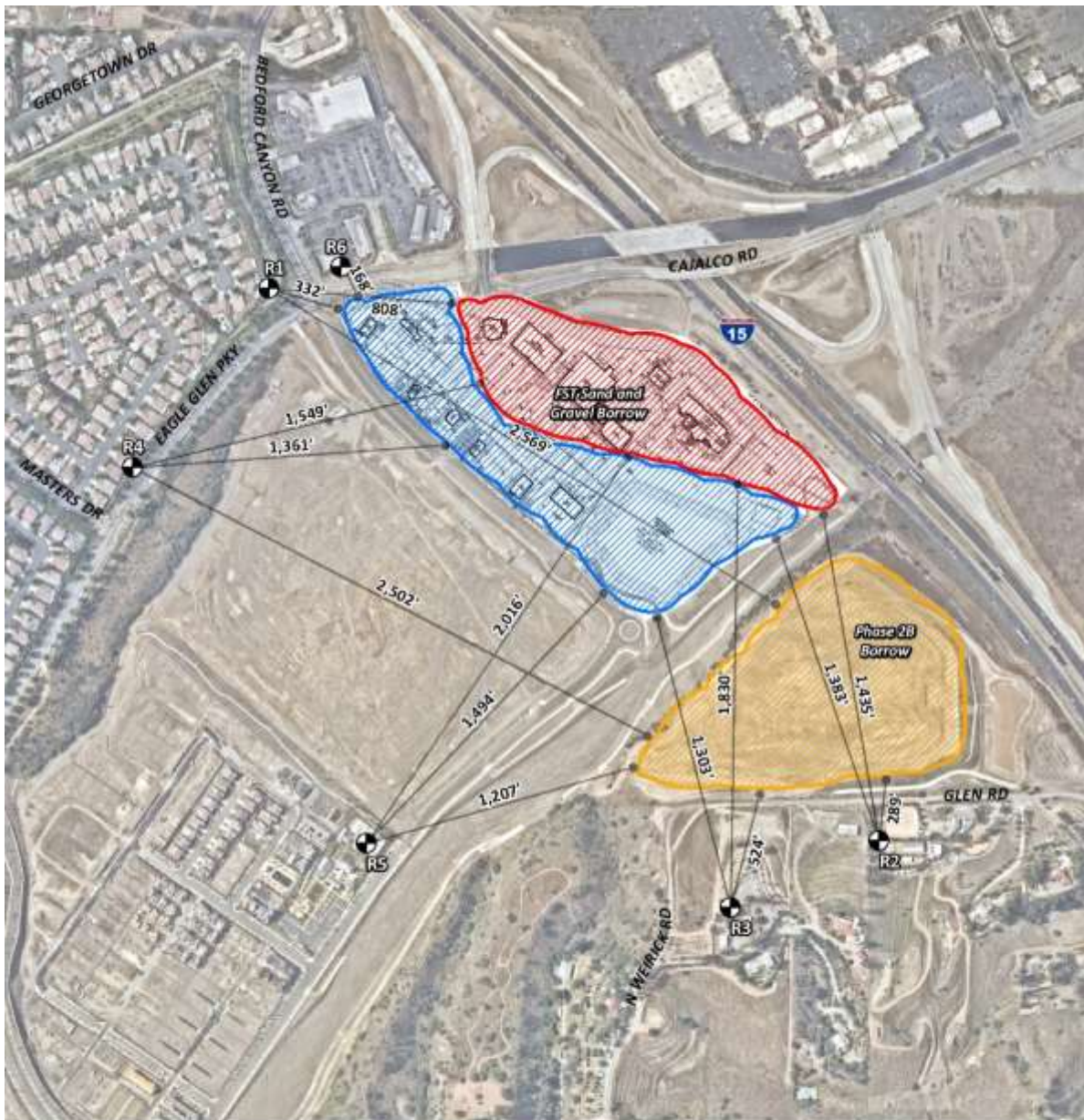
EXHIBIT E: RECEPTOR LOCATIONS