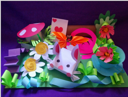
Maker: Ms. April

Create a one-of-a-kind artistic piece using only a few simple tools and your imagination!