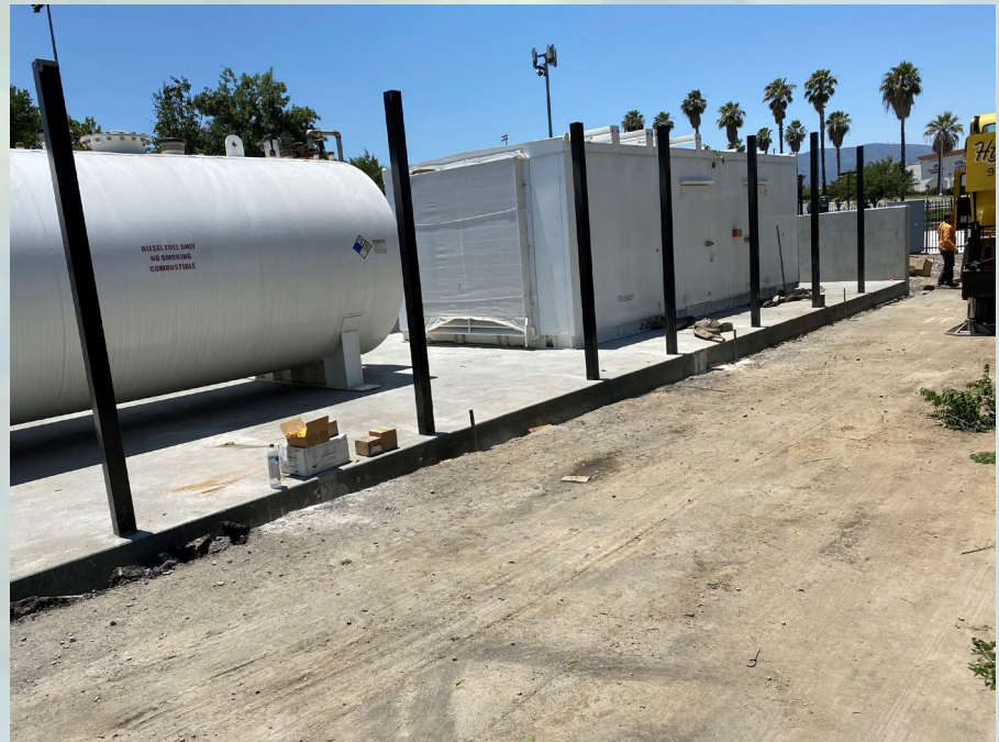
FUEL TANK AND ENCLOSURE INSTALLED ON PAD