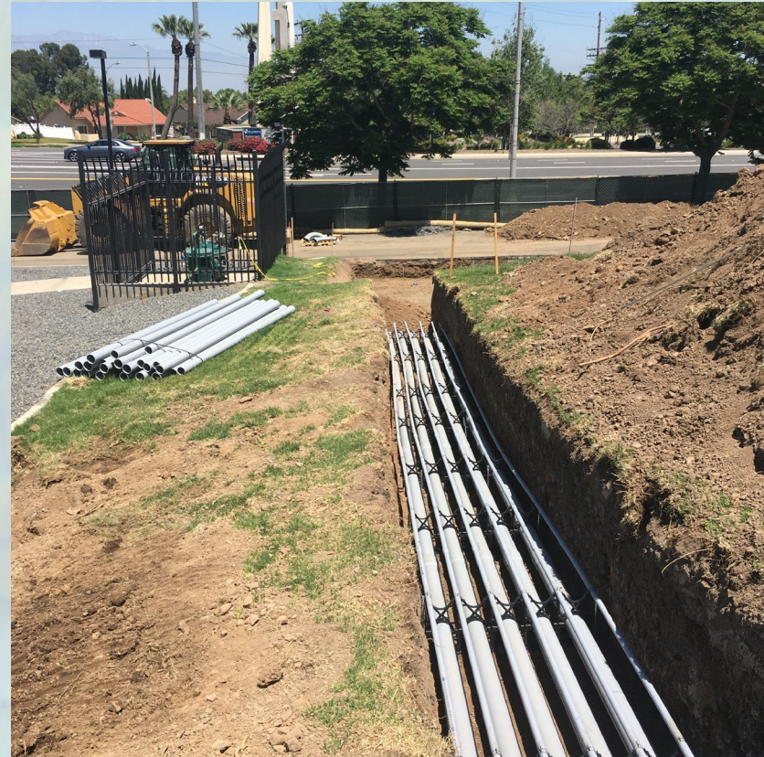
POWER CONDUITS INSTALLATION