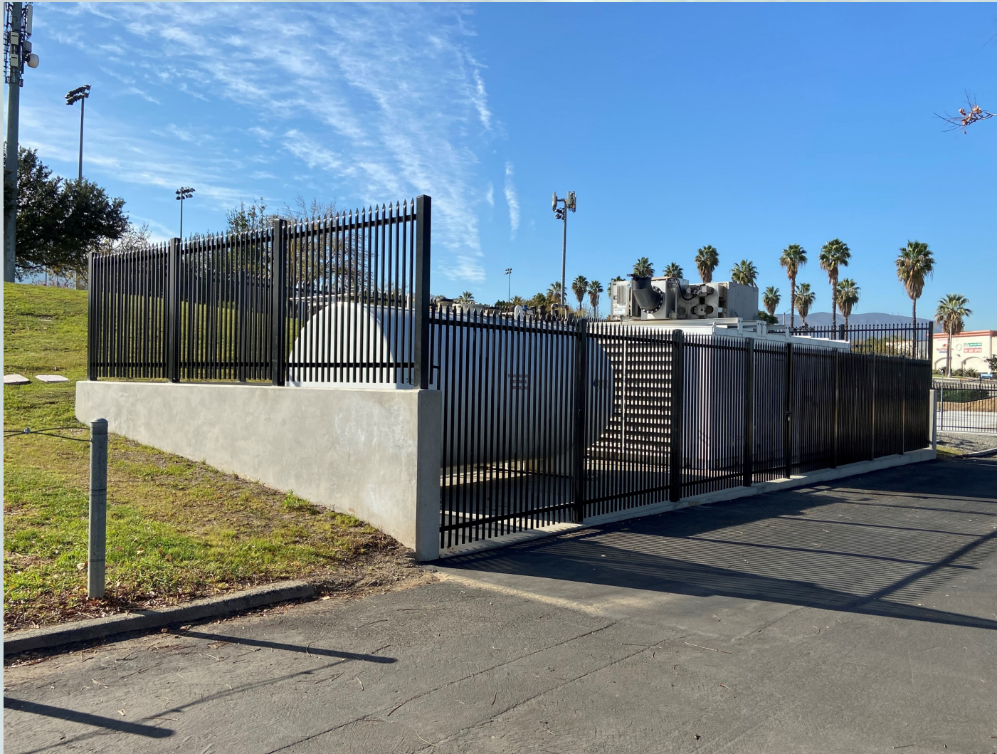
FUEL TANK AND GENERATOR ENCLOSURE INSIDE SECURITY FENCING