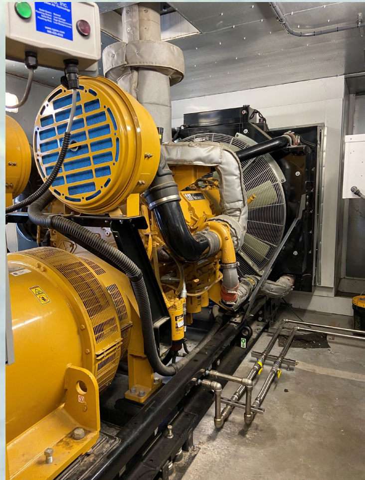
1 MW GENERATOR