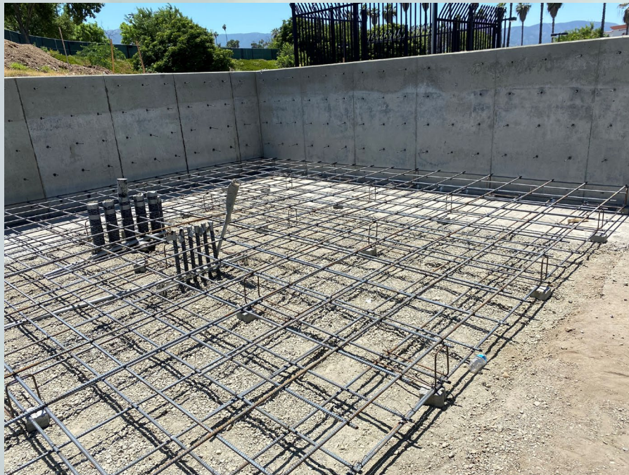
RETAINING WALLS CONSTRUCTED PAD REINFORCING STEEL INSTALLED