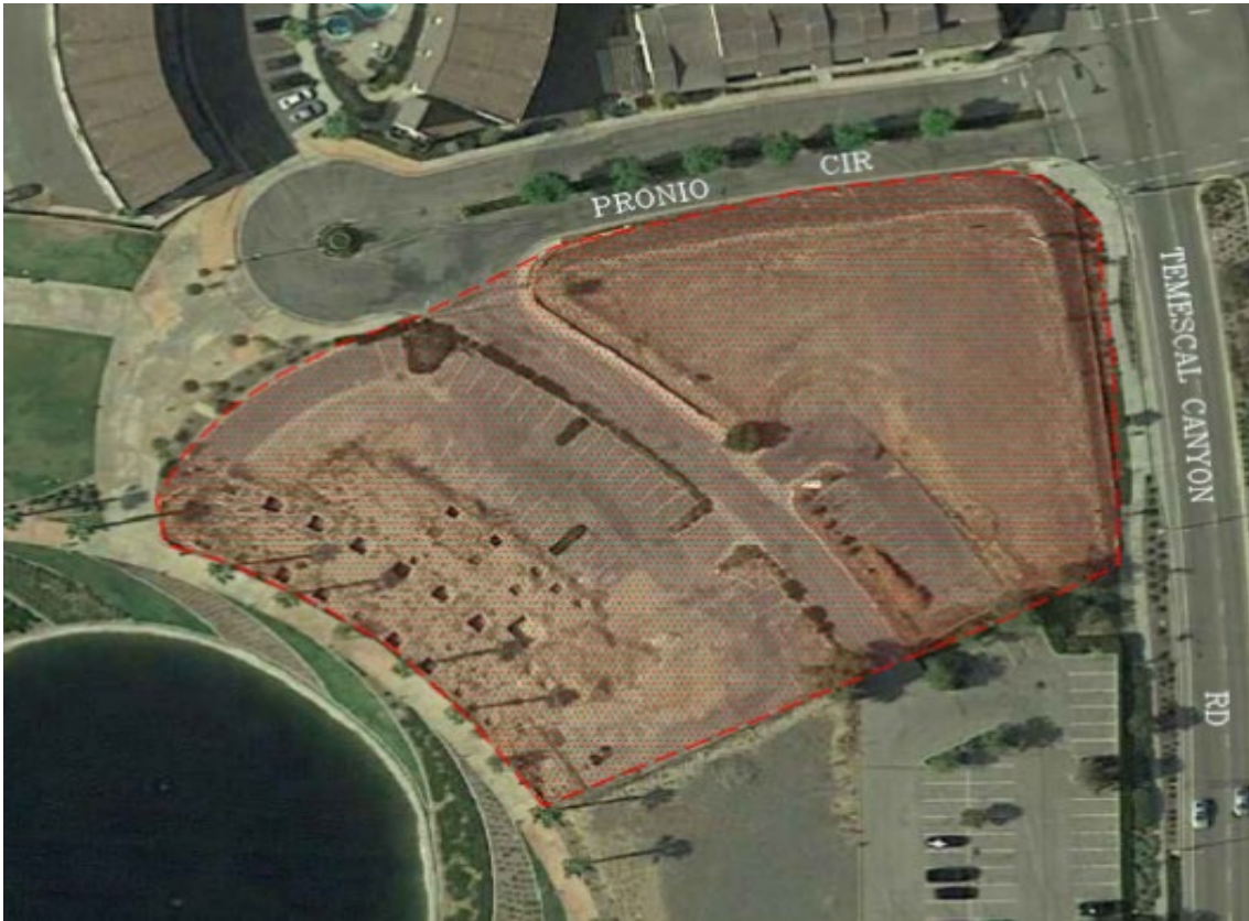
LL&G, April 30, 2020

f. LL&G evaluated the internal circulation in terms of vehicle-pedestrian conflicts and driveway spacing. Based on the proposed site plan, the overall layout does not create any significant vehicle-pedestrian conflict points as the parking lots are self-contained. Motorists entering and exiting the project site from the existing internal driveway will be able to do so comfortably, safely, and without undue congestion as Pronio Circle provides a circular terminus to accommodate both resident and patron traffic for proper turnaround circulation. The project site also has a secondary access from within The Shops commercial development to the south of the project. Therefore, no impacts related to traffic hazards from design features are expected.