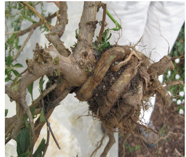
girdled roots –bad news!