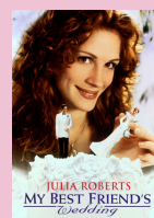
February 1 My Best Friend's Wedding