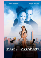
February 15 Maid in Manhattan