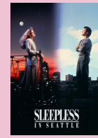
February 22 Sleepless in Seattle