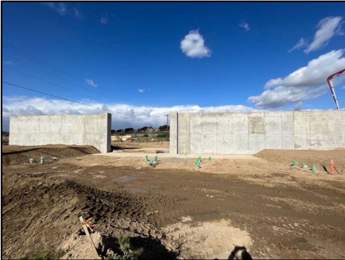
Auburndale Floodwall and Floodgate Columns