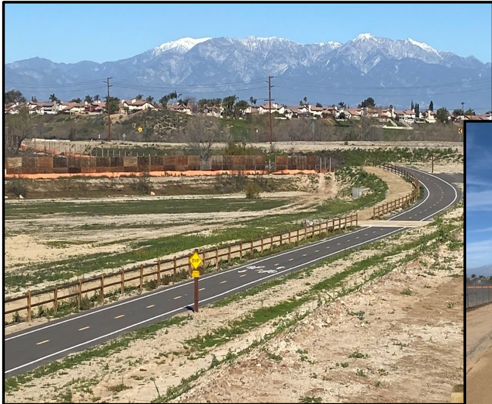
Bike path along the adjacent Santa Ana River Trail (Phase 4)

The trail is complete as of January 2023 minus clean-up and adjacent slope landscaping