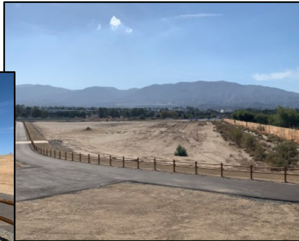
Placement of riprap (stone protection) in Butterfield Park section of Dike