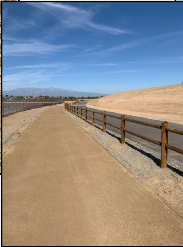
DG Section of new Santa Ana River Trail

The trail is complete as of January 2023 minus clean-up and adjacent slope landscaping