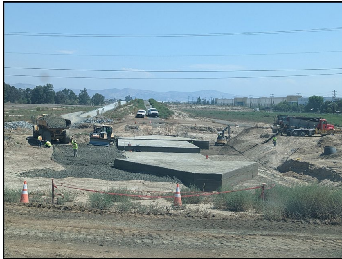
Foundation for utility protection, Auburndale Floodgate