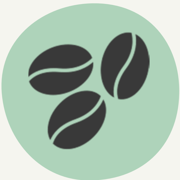
COFFEE/ TEA BAGS