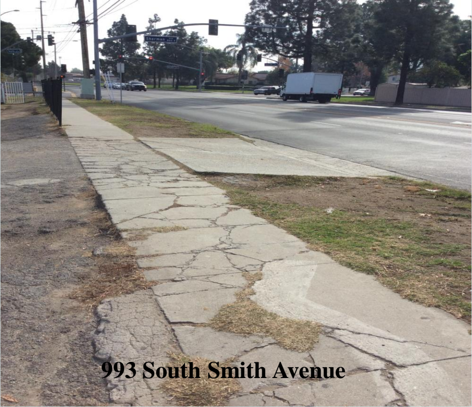
993 South Smith Avenue