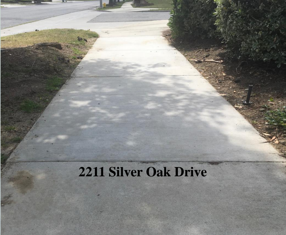
2211 Silver Oak Drive