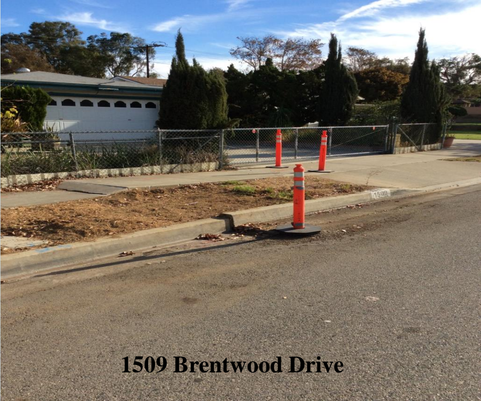
1509 Brentwood Drive