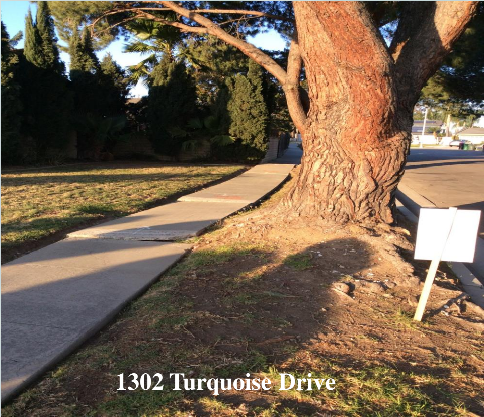
1302 Turquoise Drive