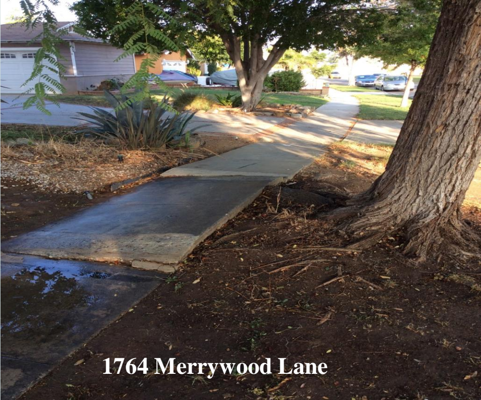
1764 Merrywood Lane