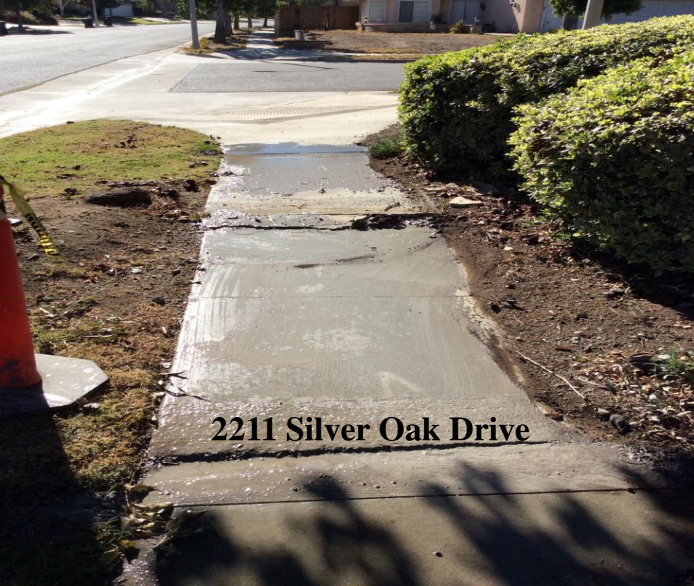
2211 Silver Oak Drive