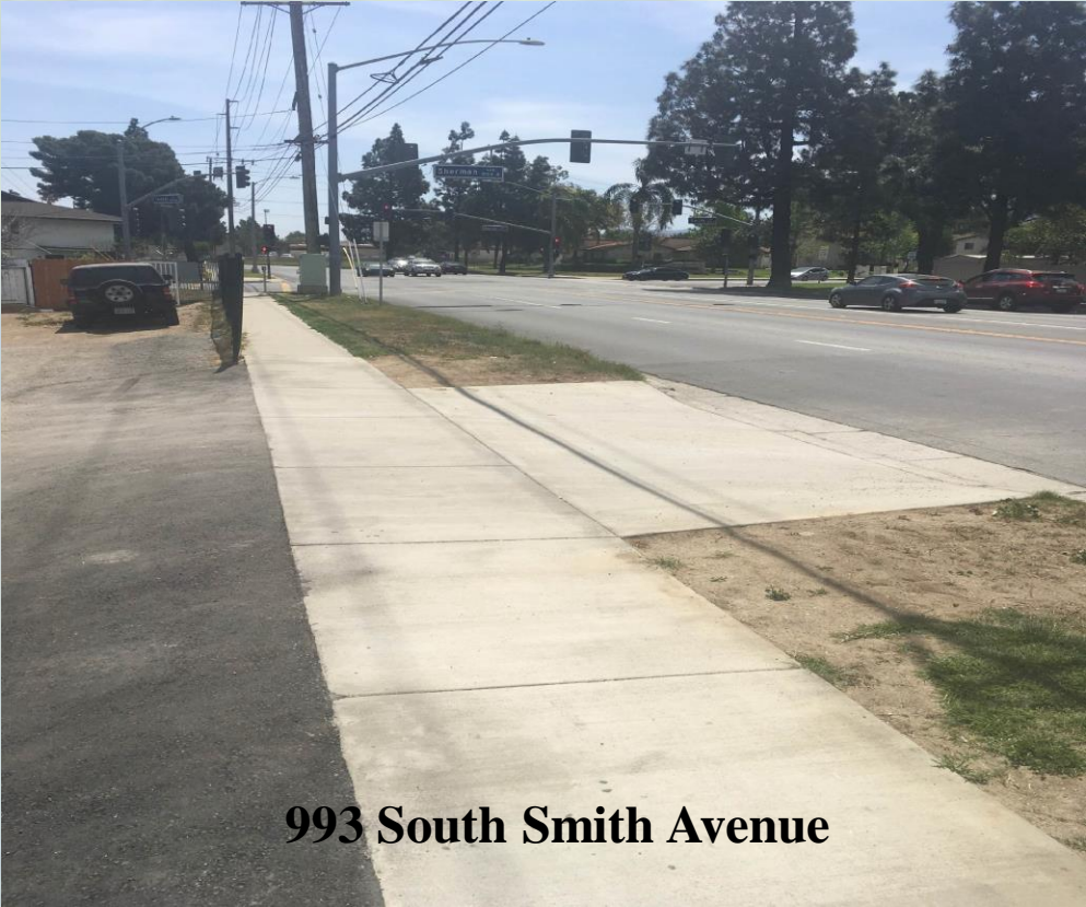
993 South Smith Avenue