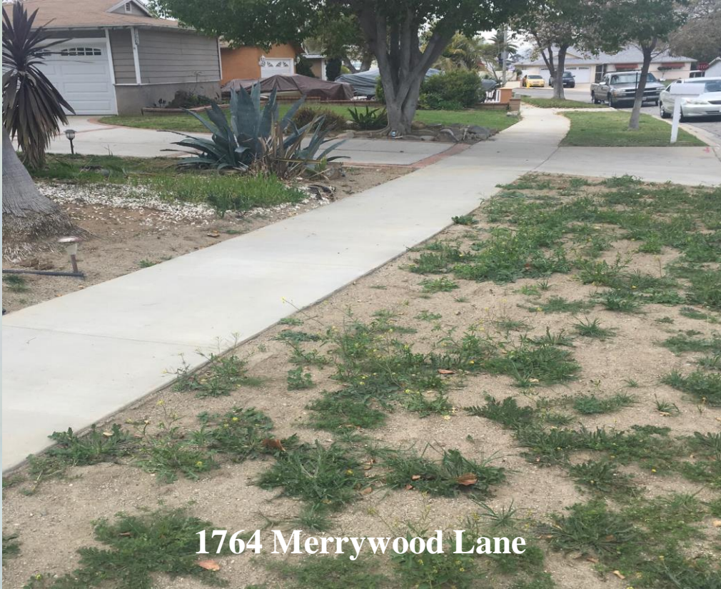
1764 Merrywood Lane