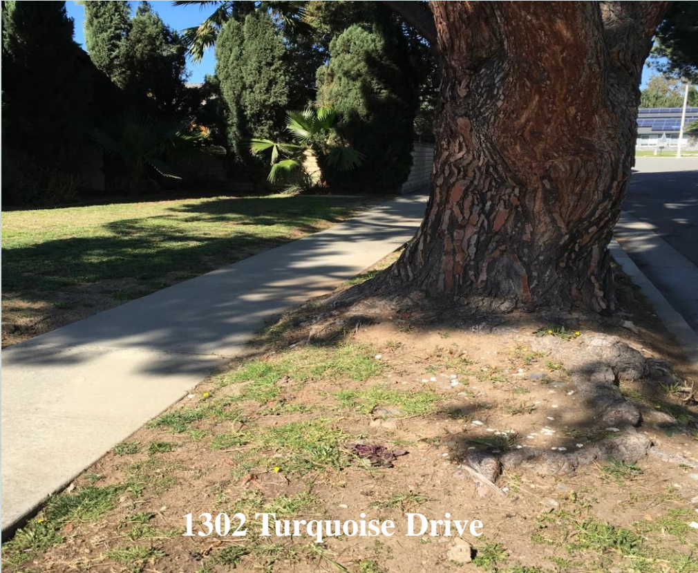
1302 Turquoise Drive