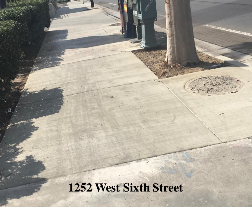
1252 West Sixth Street