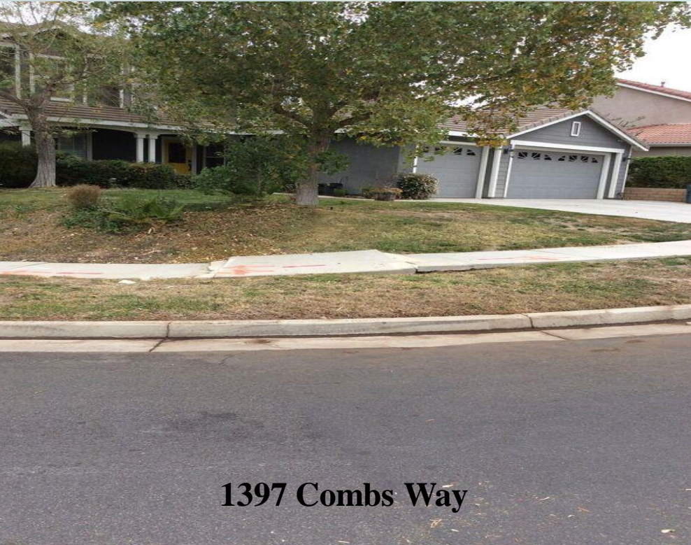
1397 Combs Way