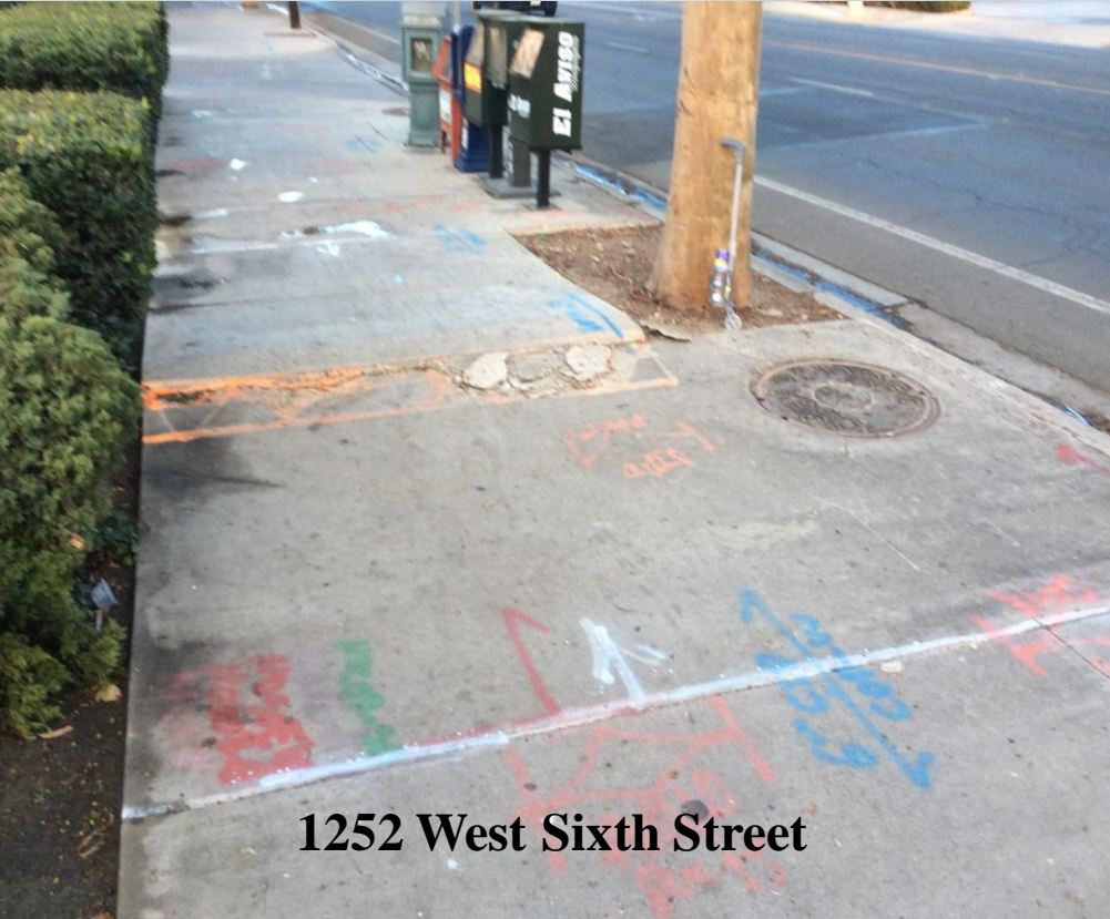
1252 West Sixth Street