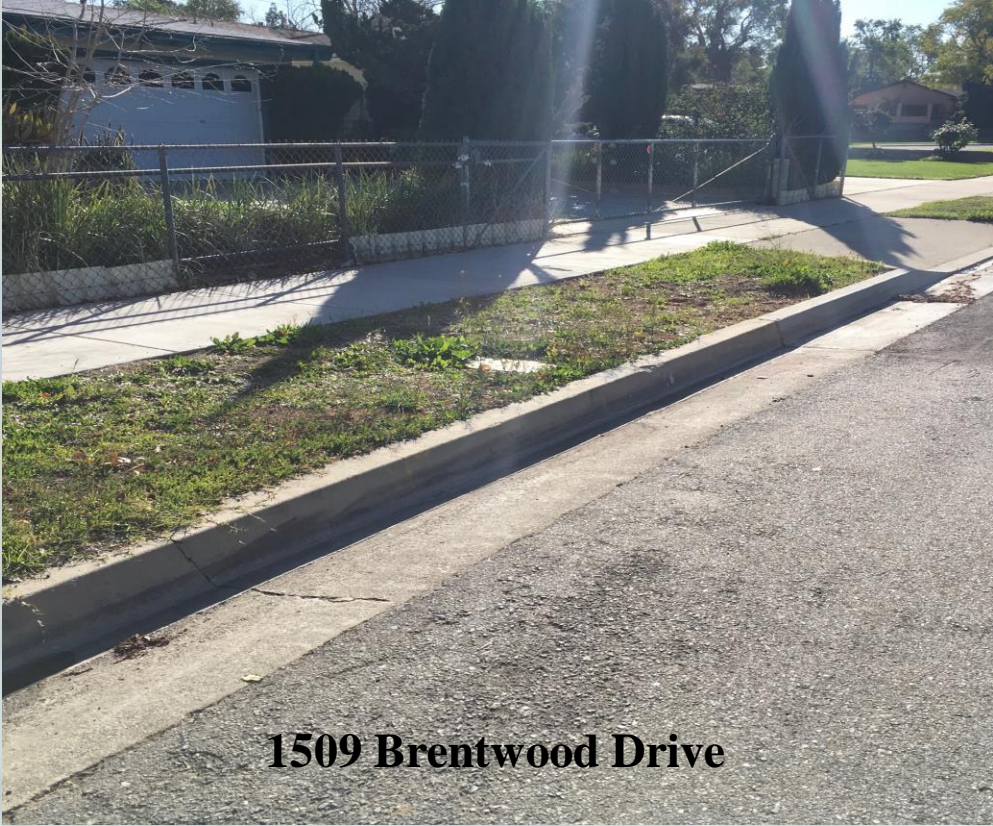
1509 Brentwood Drive