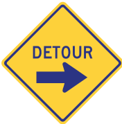
LANE CLOSURES & DETOURS

Please expect lane closures, detours and parking restrictions near the work sites during construction activity. Bedford Canyon Road will be closed to thru traffic during nighttime construction. Temporary traffic control will be removed daily prior to morning traffic. Mail and package delivery is expected to continue unhindered during the daytime. Local and emergency access will be maintained at all times.