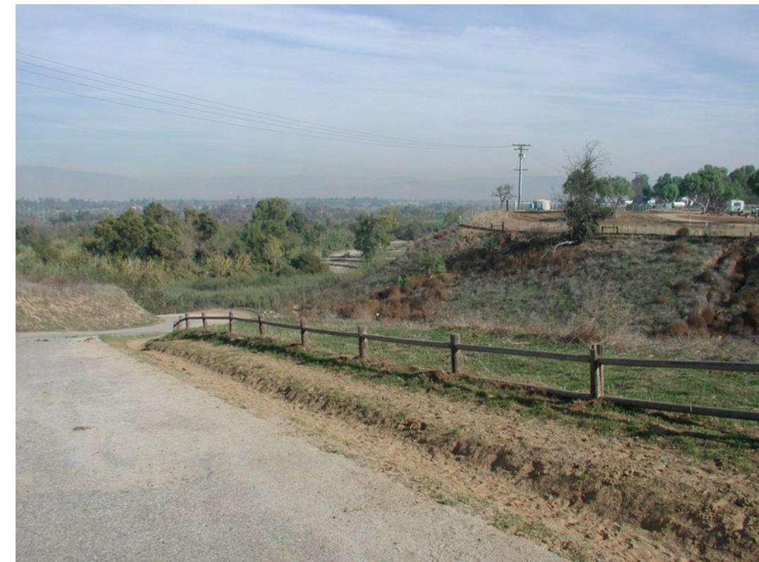
Existing connection from riverbed to proposed Pedley Avenue soft surface trail.

Upstream of Hamner Ave., between Woodward Ave. and Hillside Ave., the soft surface portion of the trail will be located on the existing USACE bluff stabilization bench. At Hillside Ave., the trail will exit the bench, and drop down to the river bed where it will continue eastward on land owned by the city, to a trail extension off of Pedley Ave. The route on the stabilization bench will require safety upgrades and a use agreement. From Pedley Ave. to Hidden Valley Wildlife Area, the trail will again use existing Norco equestrian trails.